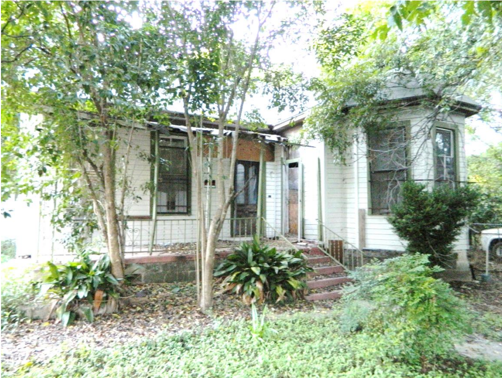
2308 Oak Crest Drive Moved onto this site from an unknown location ca. 1955