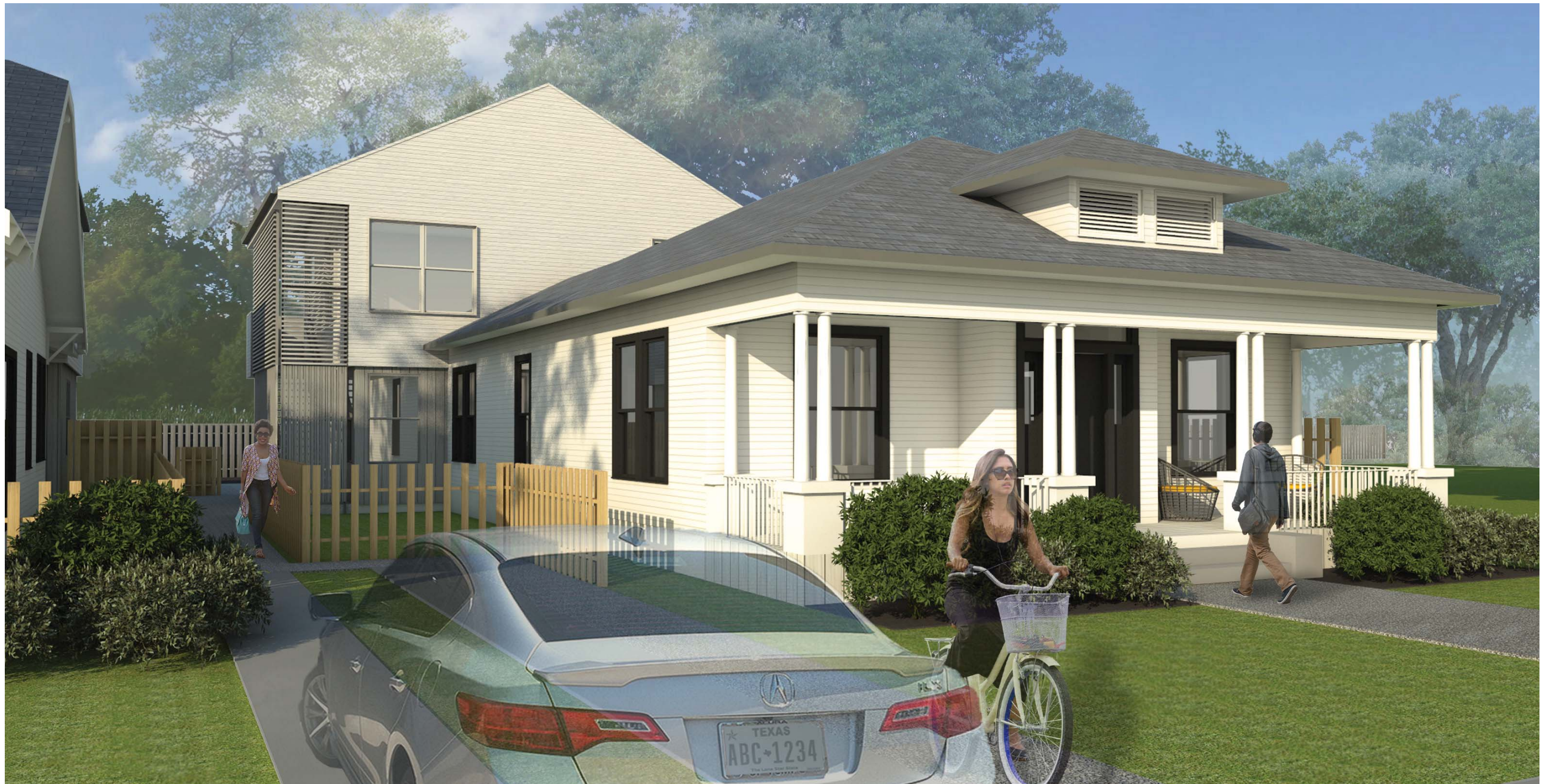
4008 AVENUE C