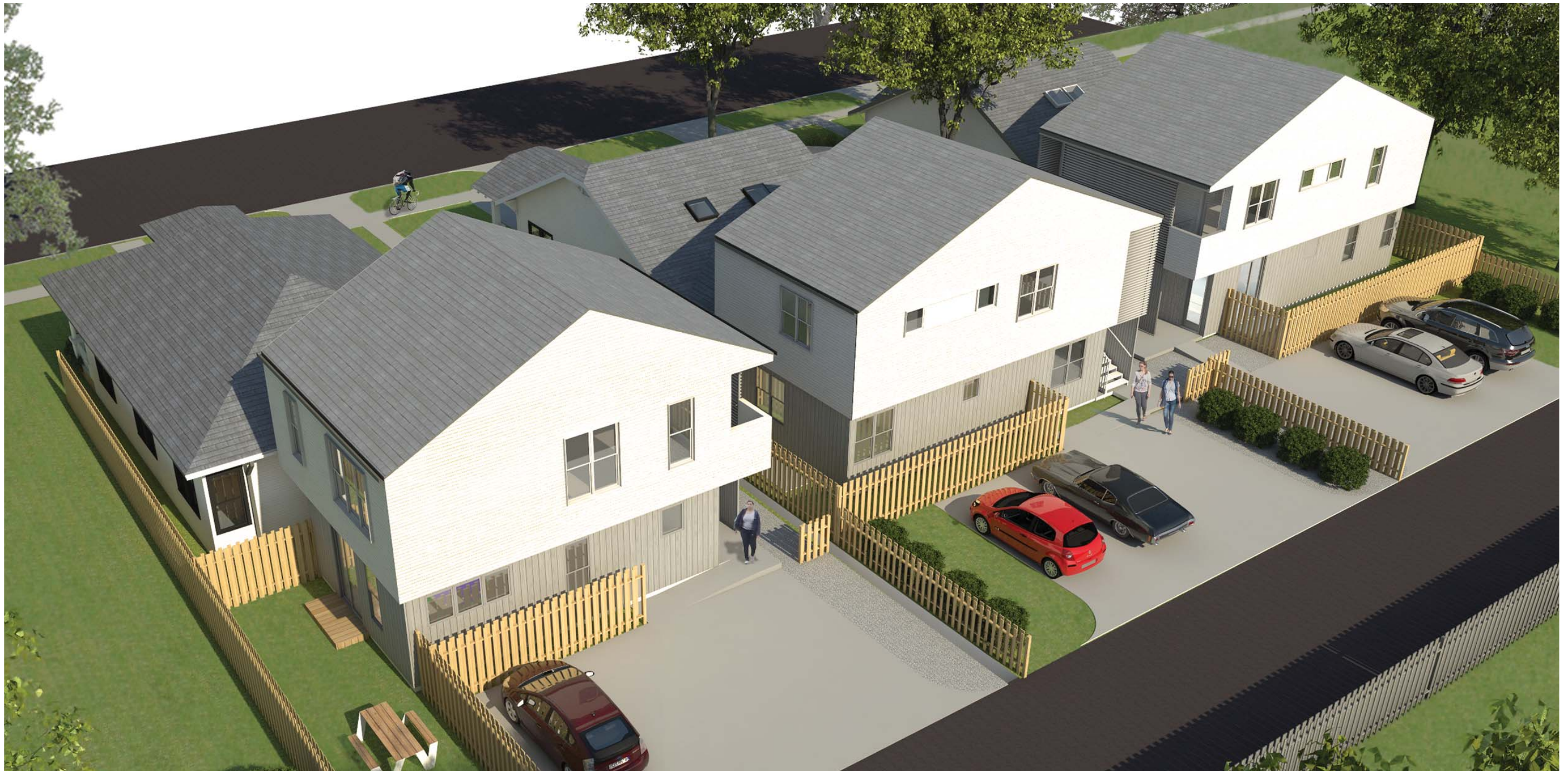
SOUTH VIEW FROM ALLEY