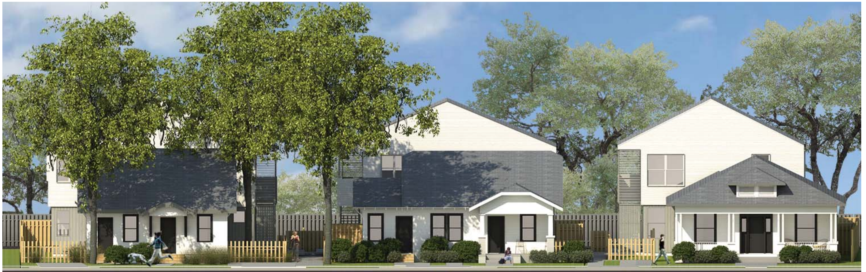
ELEVATION FROM AVENUE C