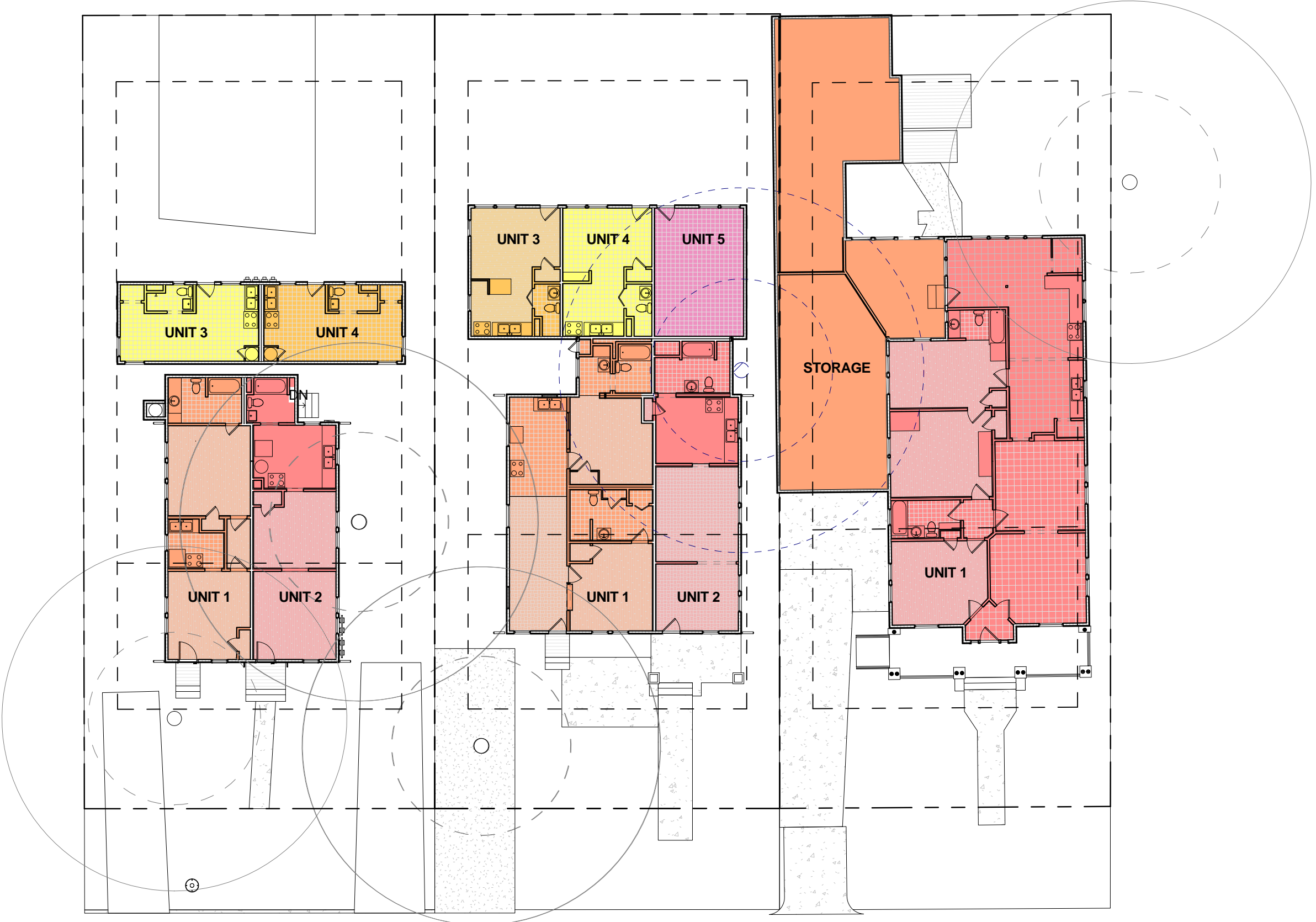
EXISTING 4004 AVENUE C (MF-4)