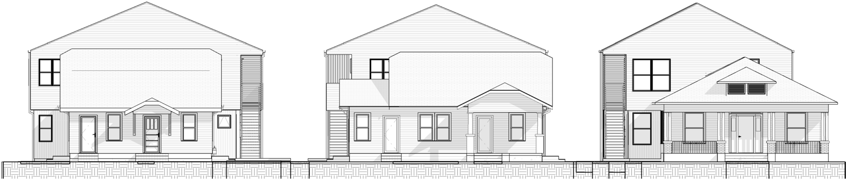
1 EAST ELEVATION Copy 1 Scale: 3/32" = 1'-0"