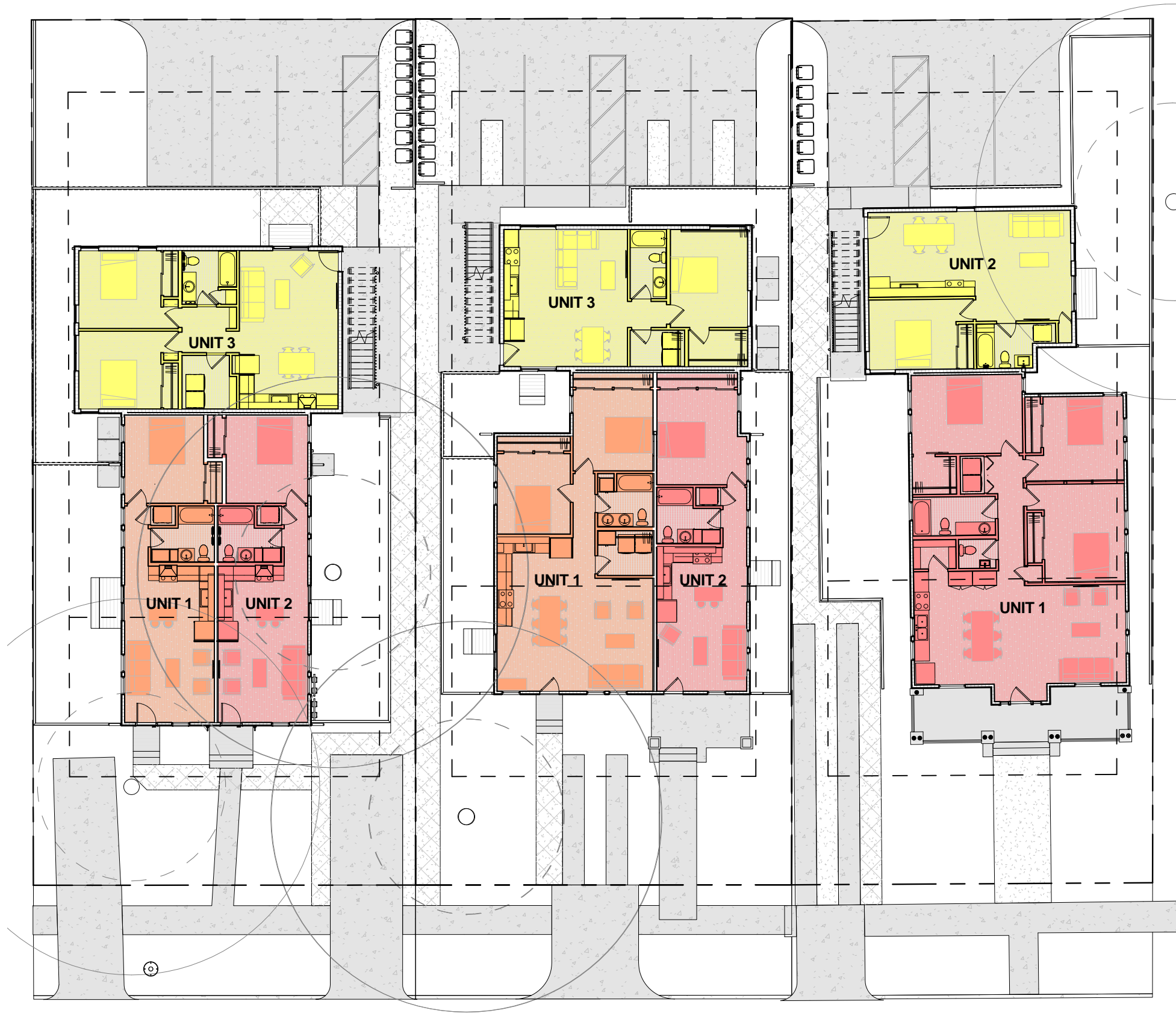
4004 AVENUE C (MF-4) UNITS: 2 X 1BR/1BA, 2 X 2BR/1BA