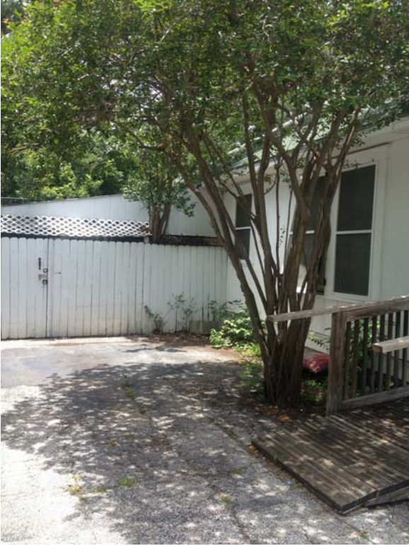
SOUTH SIDE ELEVATION