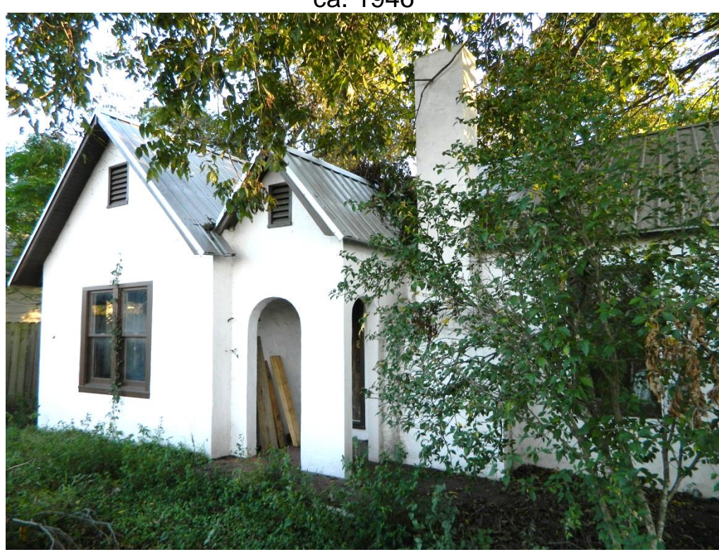
This house is vacant – it actually faces Red Bluff Drive, but mail found on the ground at the site indicates its address is 3513 E. Cesar Chavez Street.