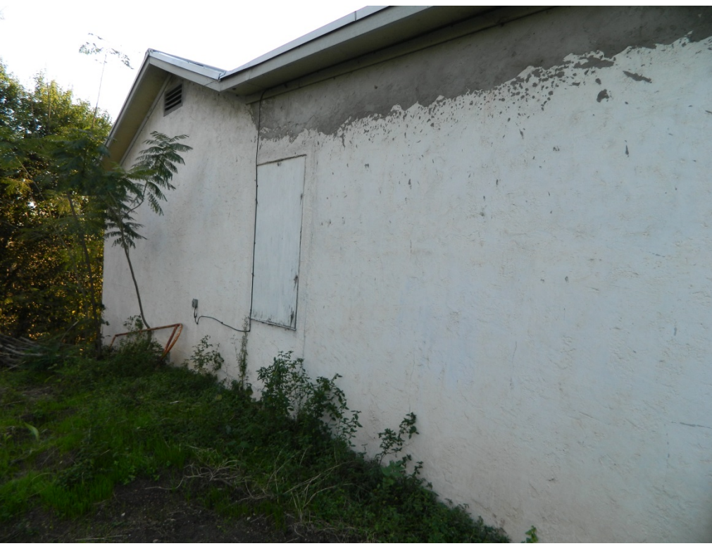
East side of the stuccoed former house to the west of the house.