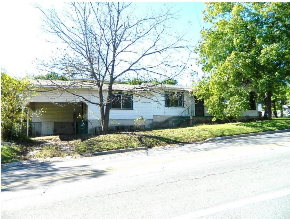
Photograph along Chestnut Avenue showing the ca. 1960 addition and carport