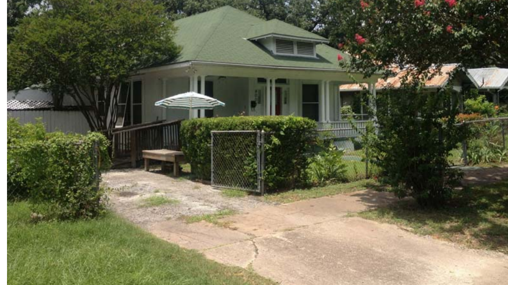
SOUTH SIDE ELEVATION