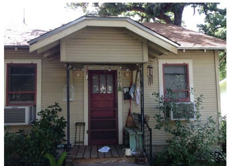
TB/DS THOUGHTBARN/DELINEATE STUDIO