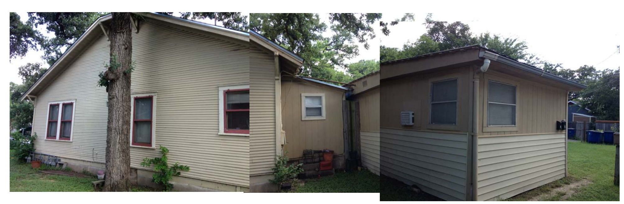
WEST ELEVATION NORTH ELEVATION

PRELIMINARY NOT FOR REGULATORY APPROVAL, PERMITTING OR CONSTRUCTION. BART WHATLEY #17672