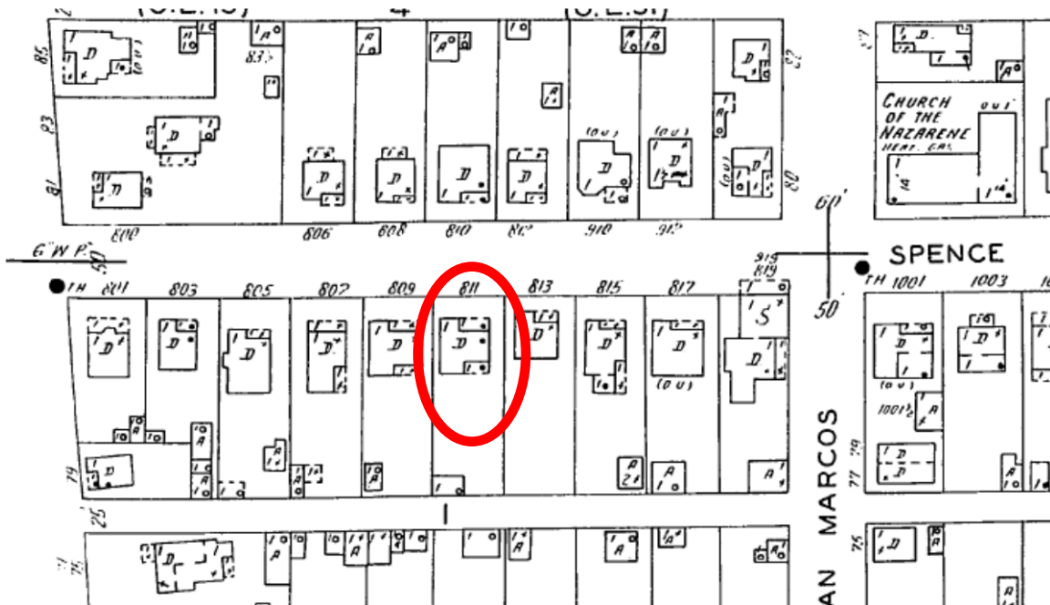
The house appears on the 1935 Sanborn map with its former address of 811 Spence Street.

Building permit to Ananias Perez for the construction of a frame addition (1967)