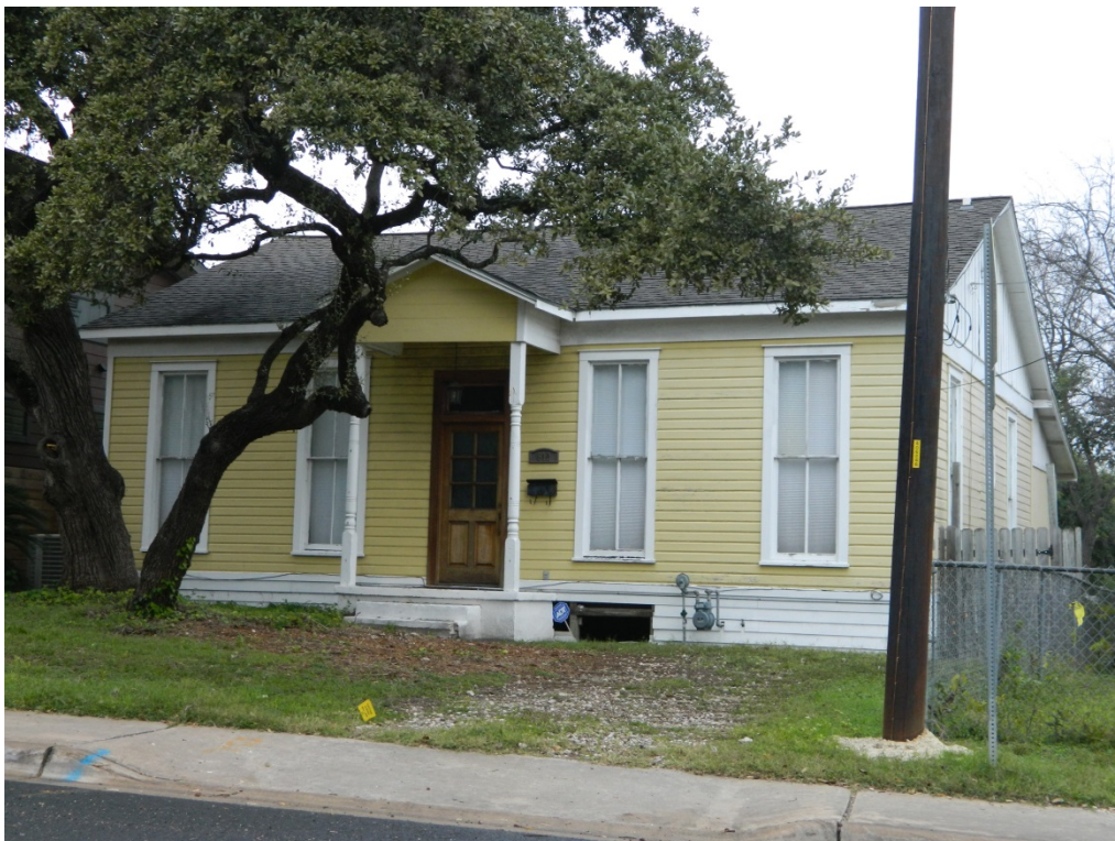
OCCUPANCY HISTORY 810 W. Live Oak Street