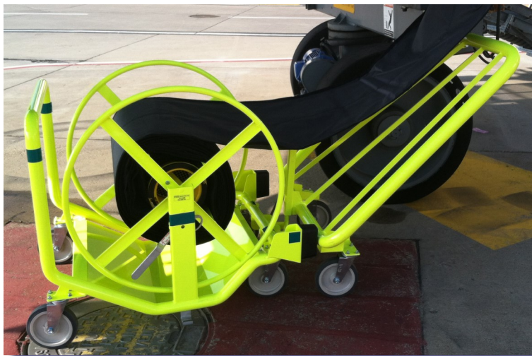
PAGE PCA440 single side mount yoke shown

The PCA400 Yoke Assembly utilizes metal tubes to allow for the most robust and long-lasting configuration possible while minimizing any dangerous sharp angles that may damage the PCAir hose or harm an operator. This easy to install and safe to use high visibility Yoke Assembly is also manufactured to the highest standards to surpass the airport ramp's harsh environment.