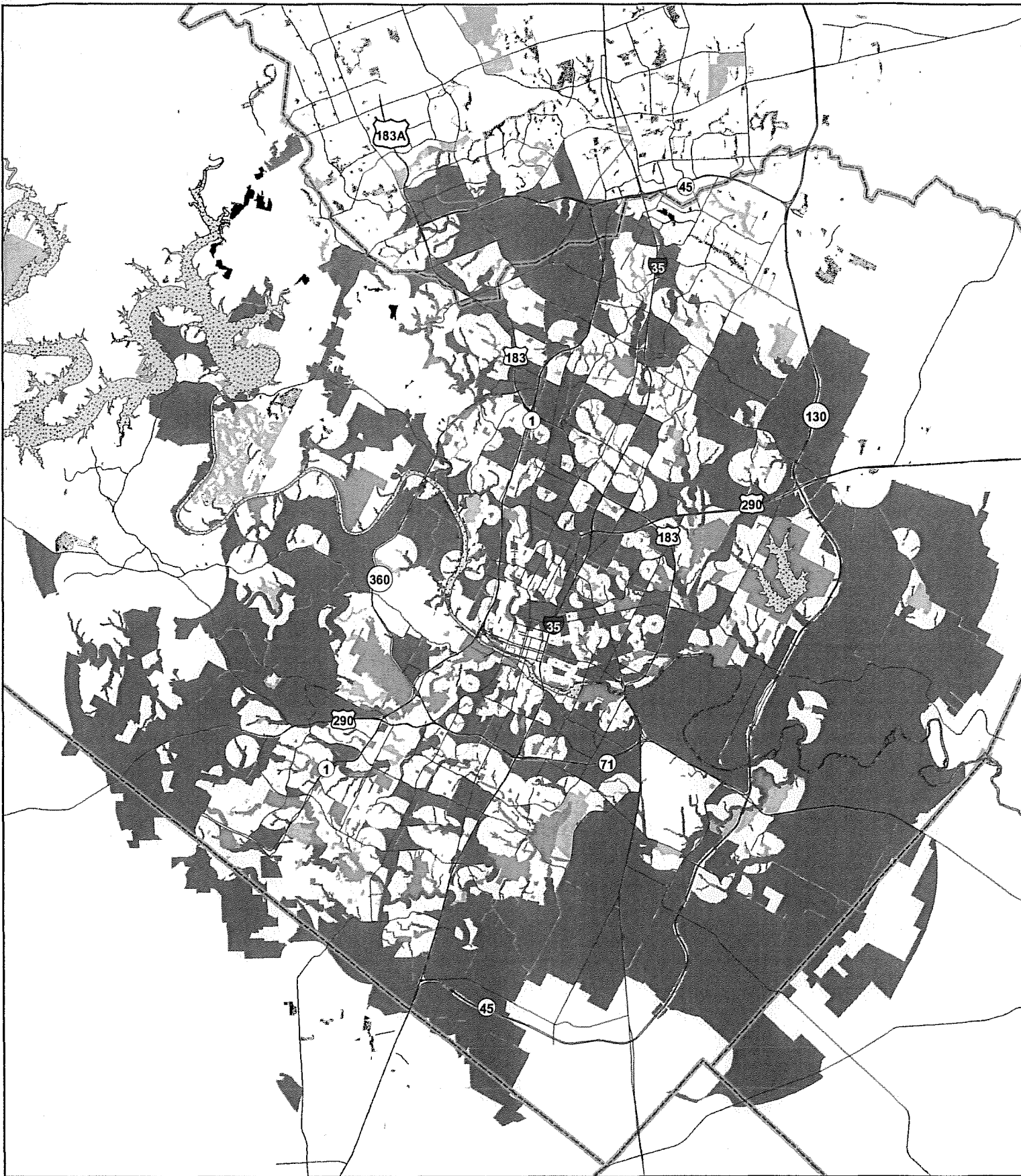
Exhibit A: Deficient Park Area Map