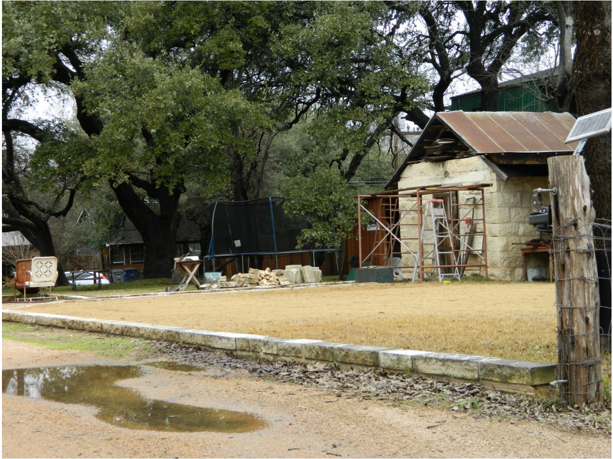
The existing driveway and parking area at the back of the homestead with the outbuilding, looking towards Newton Street (west).