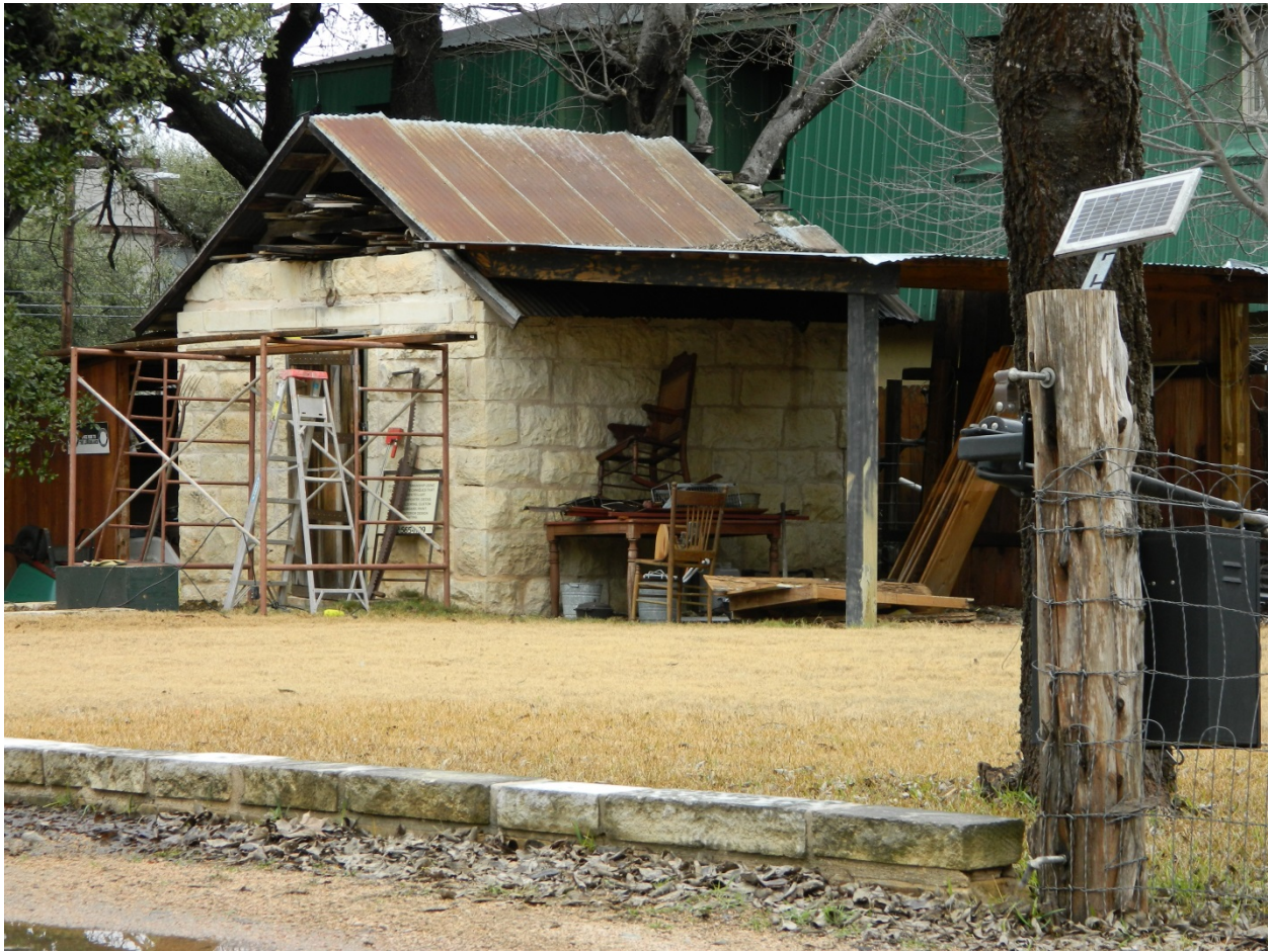
The outbuilding proposed for relocation 20 feet west (towards Newton Street) from its current site.