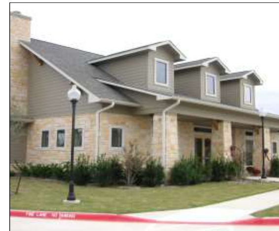
The Grove at Brushy Creek, 1101 El Dorado Street, Bowie, TX