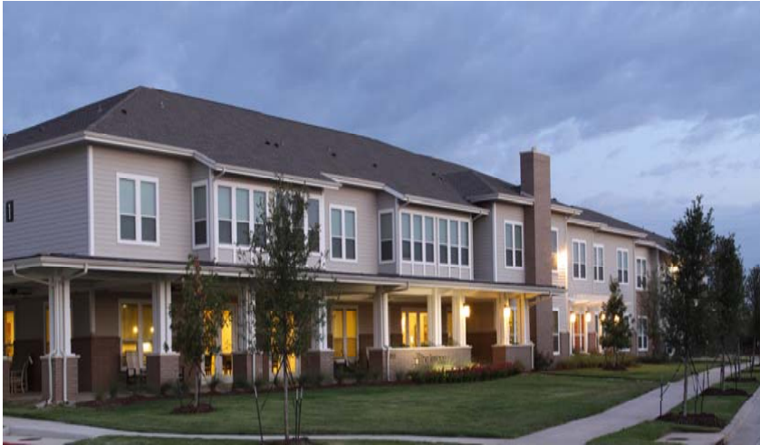
The Terrace at MidTowne, 991 Abigail Way, Midlothian, TX

DMA Development Company has perfected its senior independent living design in recent years. The typical DMA senior community consists of one two- or three-story elevator structure surrounded by single story cottages. The elevator structure is attractive to seniors who want the security of proximity to the onsite staff and amenities, while the single story cottages, which often have integrated carports, are attractive to independent residents who are perhaps downsizing from single family homes.