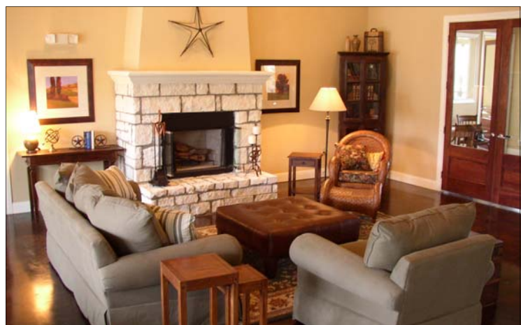
Prairie Commons, 9850 Military Parkway, Dallas, TX