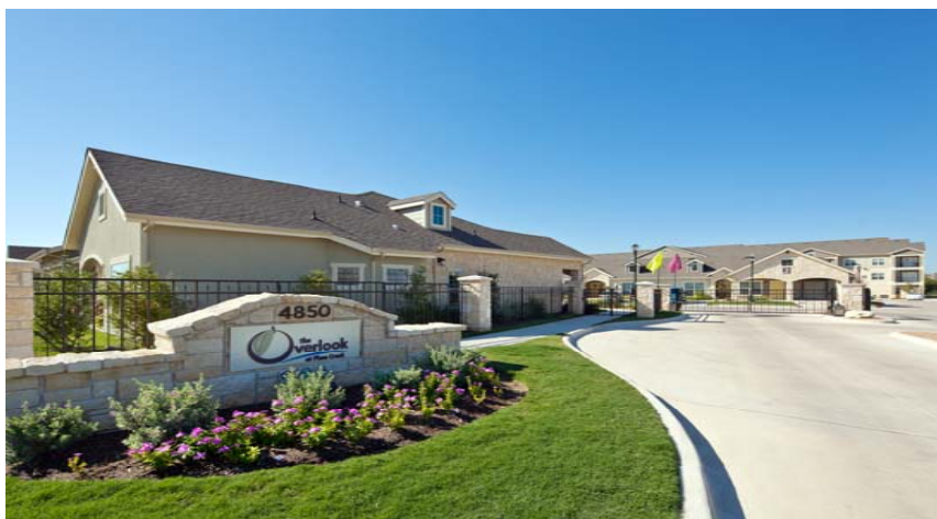
The Overlook at Plum Creek, 4850 Cromwell Drive, Kyle, T