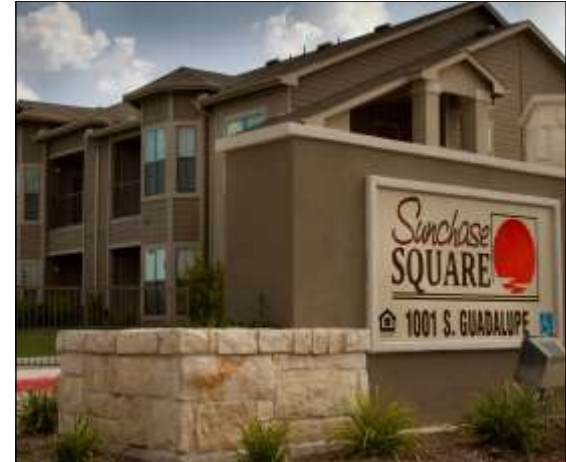
Sunchase Square, 1001 S. Guadalupe Street, Lockhart, TX