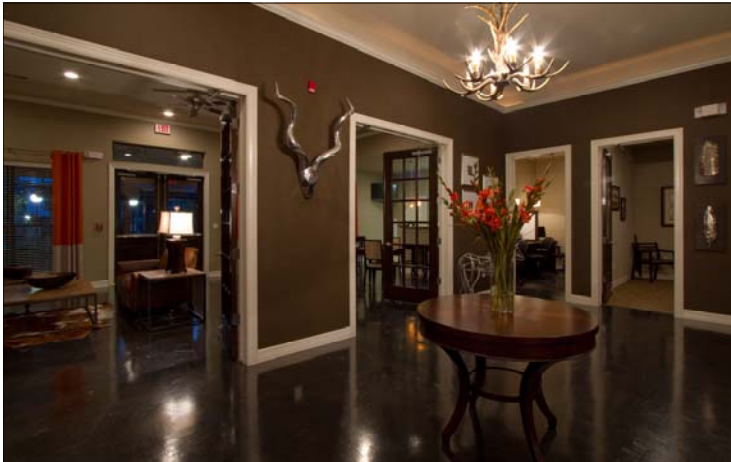
Sunchase Square, 1001 S. Guadalupe Street, Lockhart, TX