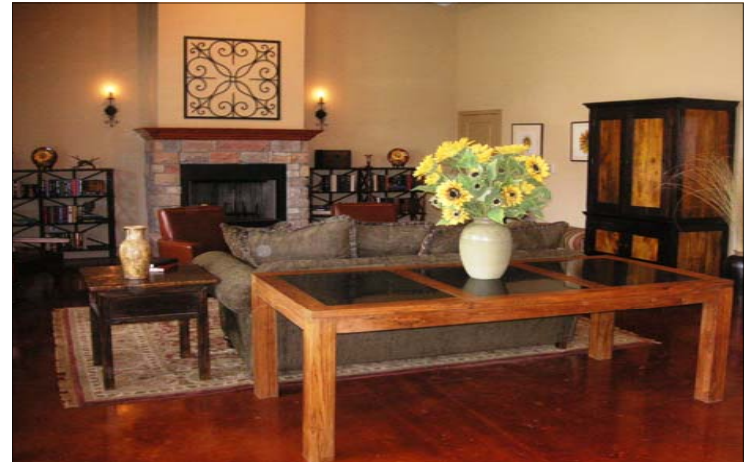
Ranch, 225 Westview Avenue, Pearsall, TX