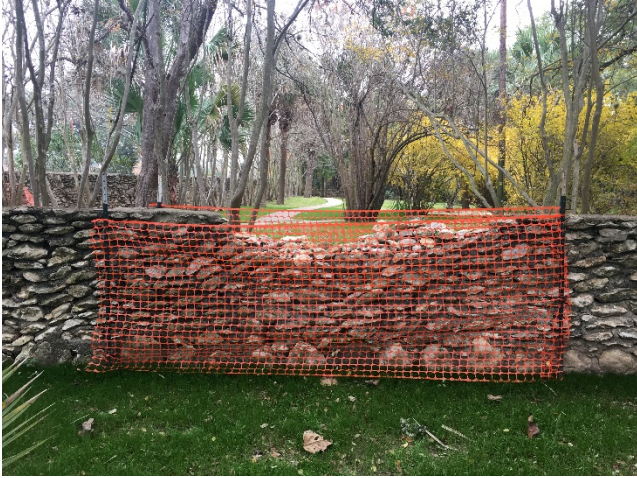
Figure 6: Wall restoration is a priority project at Mayfield Park.