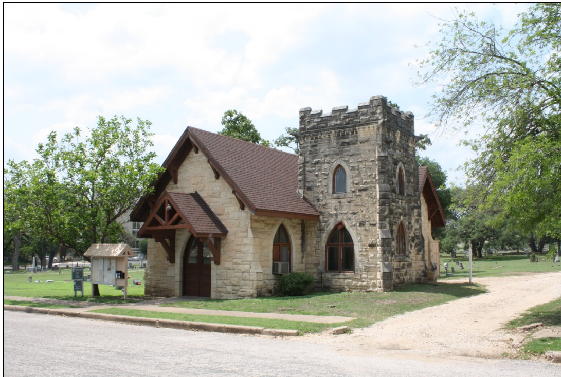
Figure 1: Oakwood Cemetery is the final resting place for four Texas Governors, famed survivor of the Alamo Susanna Dickinson and many significant Texas leaders.