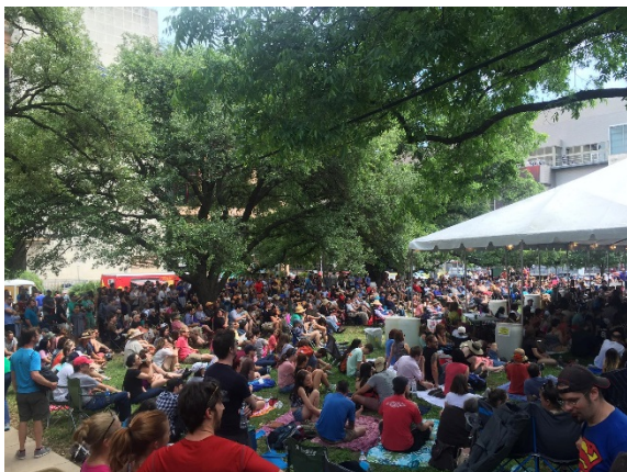
Figure 4: The O. Henry Pun Off has received media attention from all over the world.