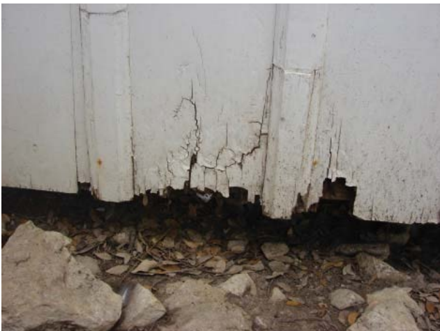
Figure 8: The Gardner's Shed is experiencing deterioration and requires restoration.