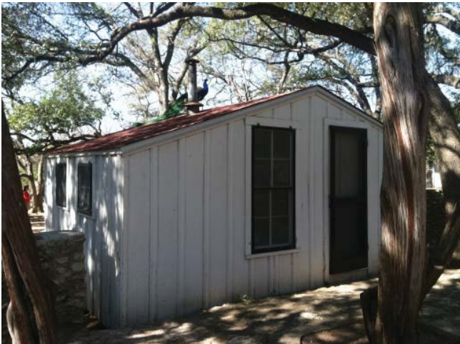
Figure 7: The Historic Gardner's Shed is an integral part of the historic landscape.