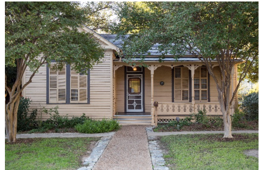
Figure 3: The O. Henry House sits in the heart of Austin's convention center district and attracts thousands of visitors each year.

Description of site: The O. Henry Museum is located in the heart of Austin's downtown on Brush Square adjacent to the Convention Center and is one of three Brush Square Museums that comprise an important cultural destination. The late nineteenth century Victorian house was the home of the famous writer William Sidney Porter and opened as a museum in 1934. The mission of the O. Henry Museum is to collect, preserve and interpret artifacts and archival materials relative to William Sidney Porter, the author otherwise known as O. Henry, for literary, educational, and historical purposes. The O. Henry Museum offers a look into the life of Porter in the Austin years leading up to his controversial prison term, after which he assumed the pen name O. Henry and set about transforming himself into the famed short story writer who authored such universal classics as "Gifts of the Magi," "The Ransom of Red Chief," and "The Cop and the Anthem." His nearly 400 short stories won him international fame. O. Henry's collected works have been translated into 10 languages. More than seventy-five percent of the objects in the museum's collection have a direct William S. Porter connection.