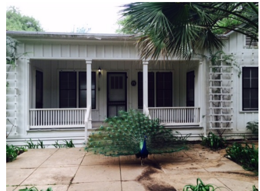
Figure 5: The 1920s Mayfield Estate is a historic, natural and cultural destination.

Visitor justification: The gardens are open to the public daily and a visitor sign-in is available at the entrance. From July—December, 2016, total visitors who signed in numbered 5,429 with 3,099 listed as out-of-town visitors. In that six-month period alone, 28 countries were represented including New Zealand, Hong Kong, Israel, and Chile. Mayfield Park is adjacent to Laguna Gloria and together, these properties create a cultural destination. The ACVB also promotes Mayfield Park in its visitor guide (p. 32).