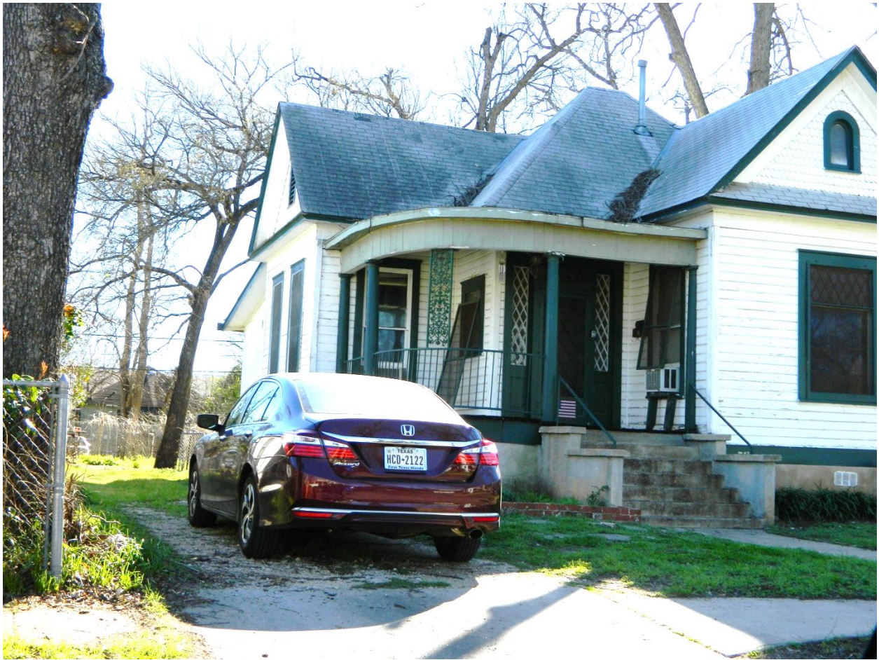
East side of the house; the proposed addition will be built at the ridgeline of the east-facing gable shown here.