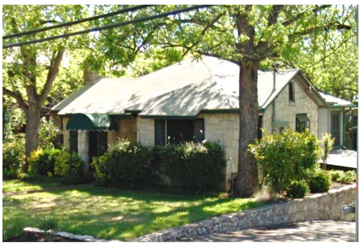
Google Streetview photo