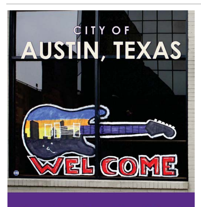
Comprehensive Annual Financial Report

For the Fiscal Year ended September 30, 2016