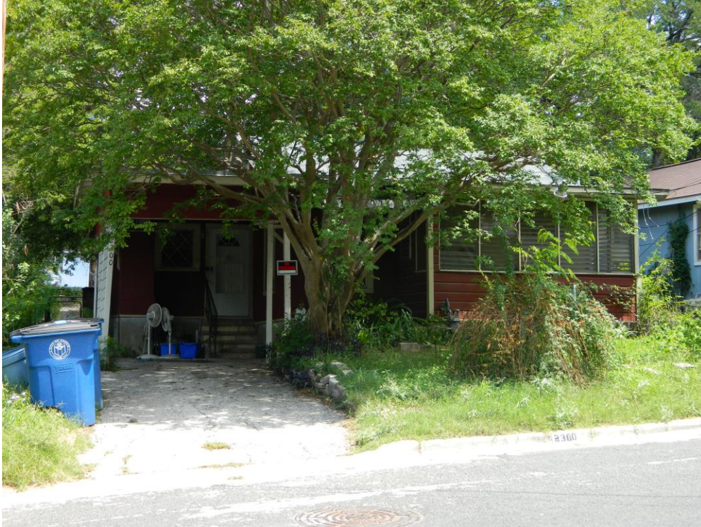
Primary (south) façade of 2300 E 10 th Street