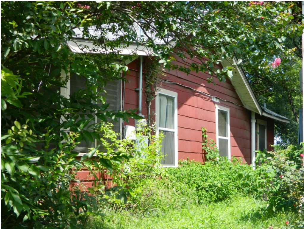
Secondary (east) façade