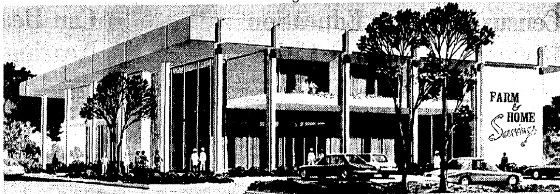
ARCHITECTS RENDERING OF FARM AND HOME SAVINGS OFFICES The two-story building will be constructed in the 1400 block of Lavaca