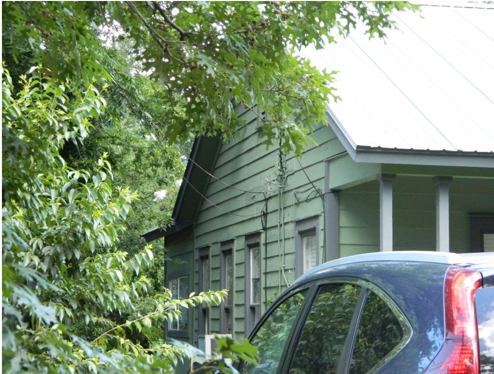
Detail of secondary (south) façade