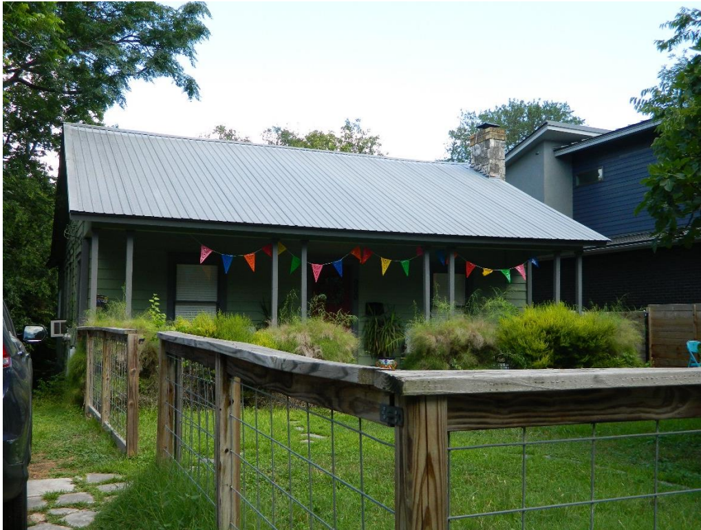
Primary (east) façade of 900 Jessie Street