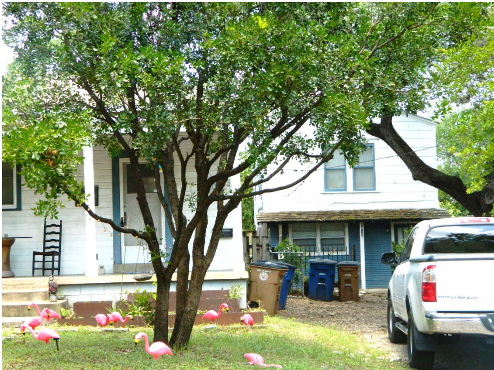
ca. 1937 garage apartment