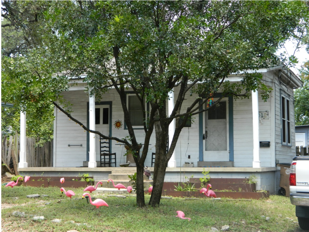
ca. 1933 house