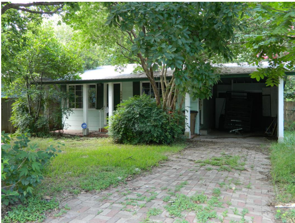
Northeast (primary) façade of 1903 W. 30 th Street