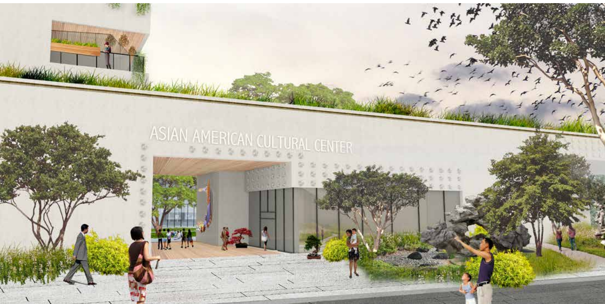
ASIAN AMERICAN CULTURAL CENTER 11713 Jollyville Road