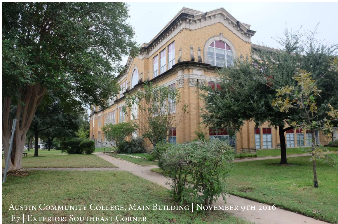
AUSTIN COMMUNITY COLLEGE, MAIN BUILDING | NOVEMBER 9TH 2016 E7 | EXTERIOR: SOUTHEAST CORNER