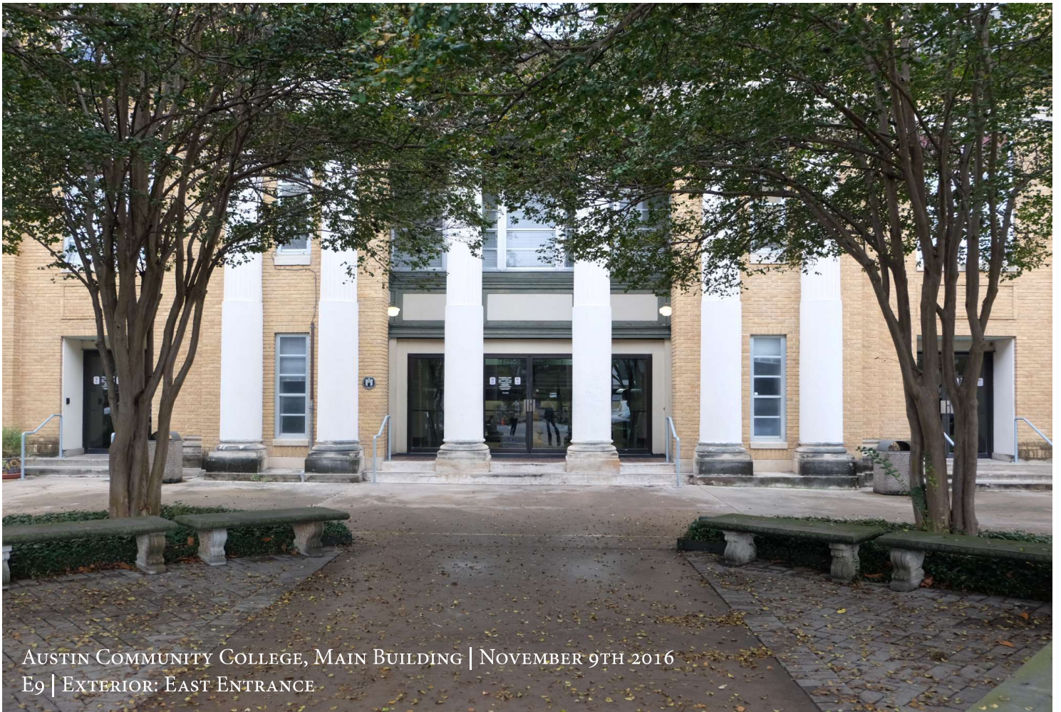
AUSTIN COMMUNITY COLLEGE, MAIN BUILDING | NOVEMBER 9TH 2016 E9 | EXTERIOR: EAST ENTRANCE