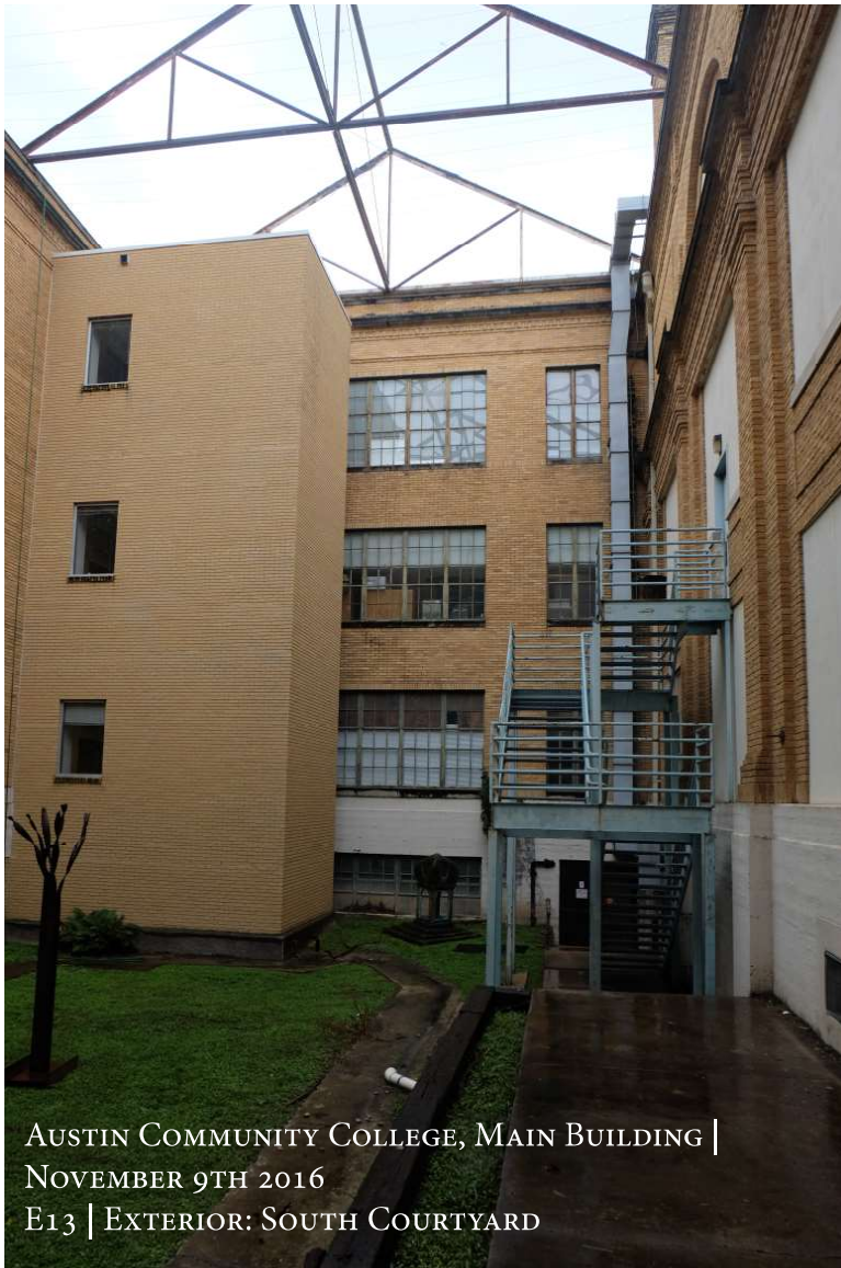
AUSTIN COMMUNITY COLLEGE, MAIN BUILDING | NOVEMBER 9TH 2016 E13 | EXTERIOR: SOUTH COURTYARD