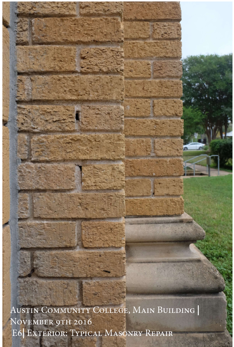
AUSTIN COMMUNITY COLLEGE, MAIN BUILDING | NOVEMBER 9TH 2016 E6 | EXTERIOR: TYPICAL MASONRY REPAIR