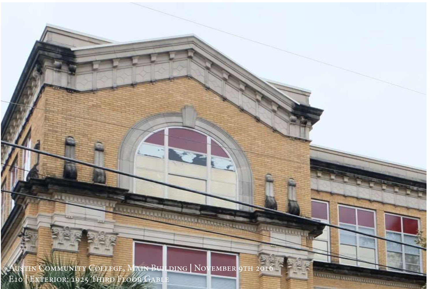
AUSTIN COMMUNITY COLLEGE, MAIN BUILDING | NOVEMBER 9TH 2016 E10 | EXTERIOR: 1925 THIRD FLOOR GABLE