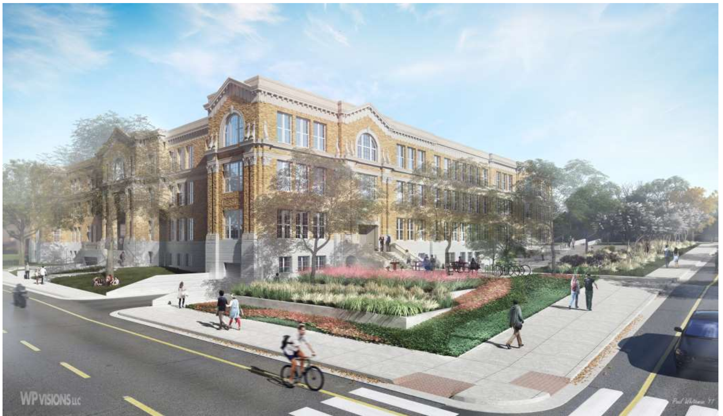
ACC Rio Grande Campus