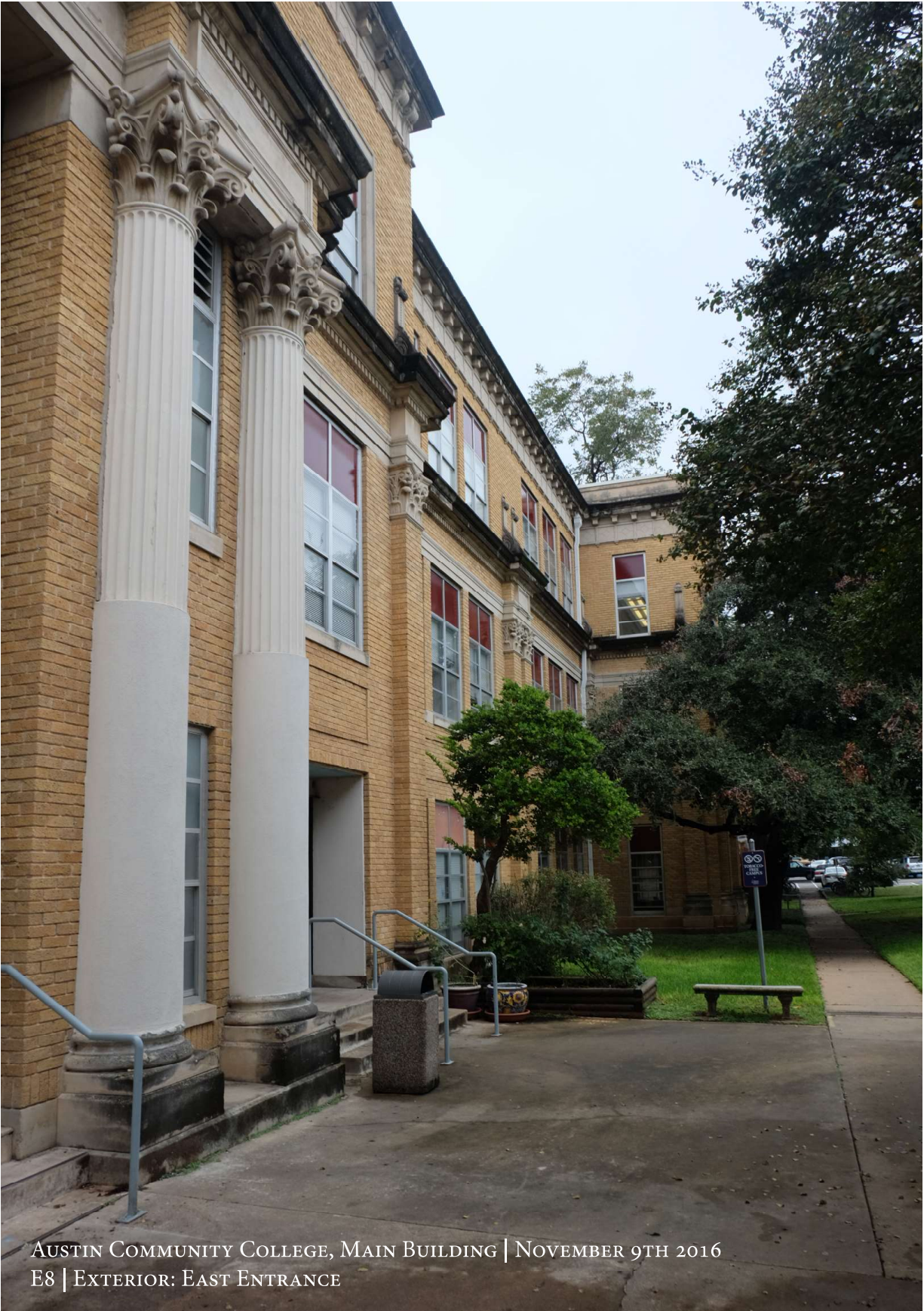
AUSTIN COMMUNITY COLLEGE, MAIN BUILDING | NOVEMBER 9TH 2016 E8 | EXTERIOR: EAST ENTRANCE