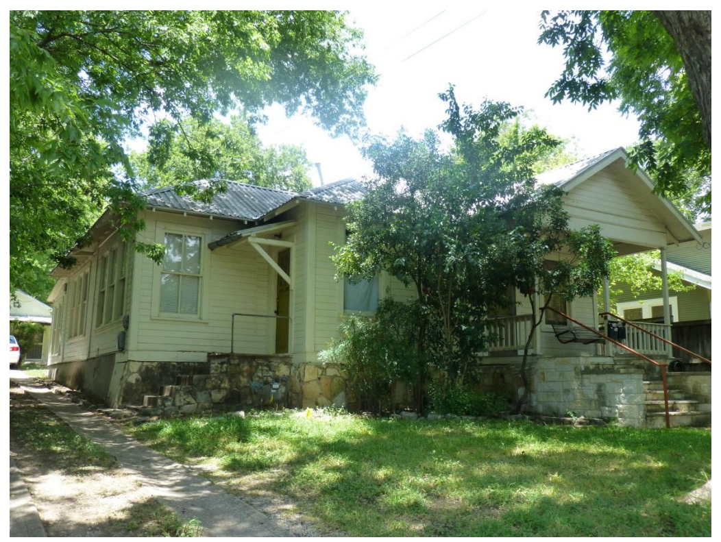
South and east facades