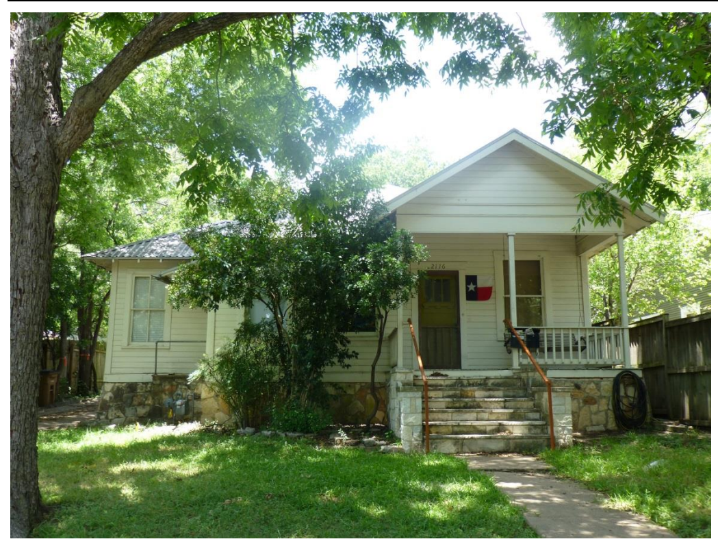
East (primary) façade of 2116 Clifton Street