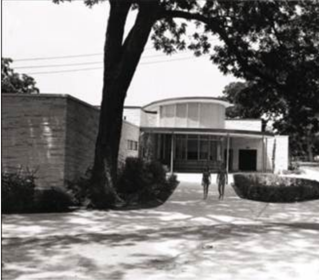
Bathhouse in 1947

The pictures below show the current Bathhouse where the original entrances are closed off and used for equipment storage.