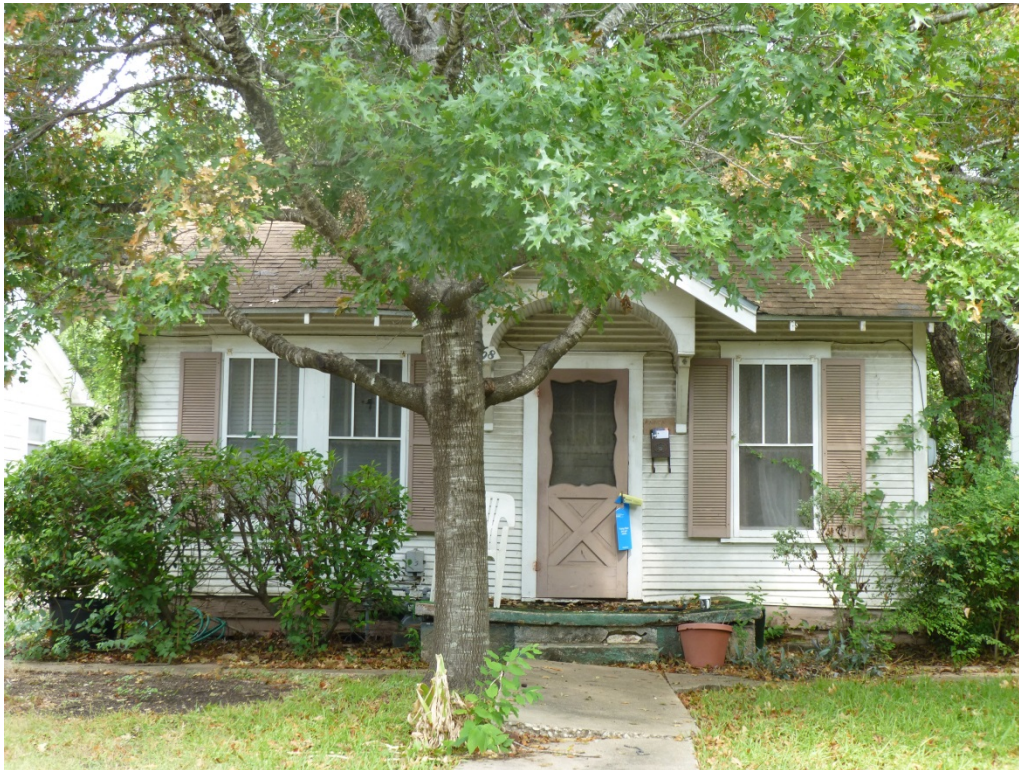
East (primary) façade of 1908 Kinney Avenue