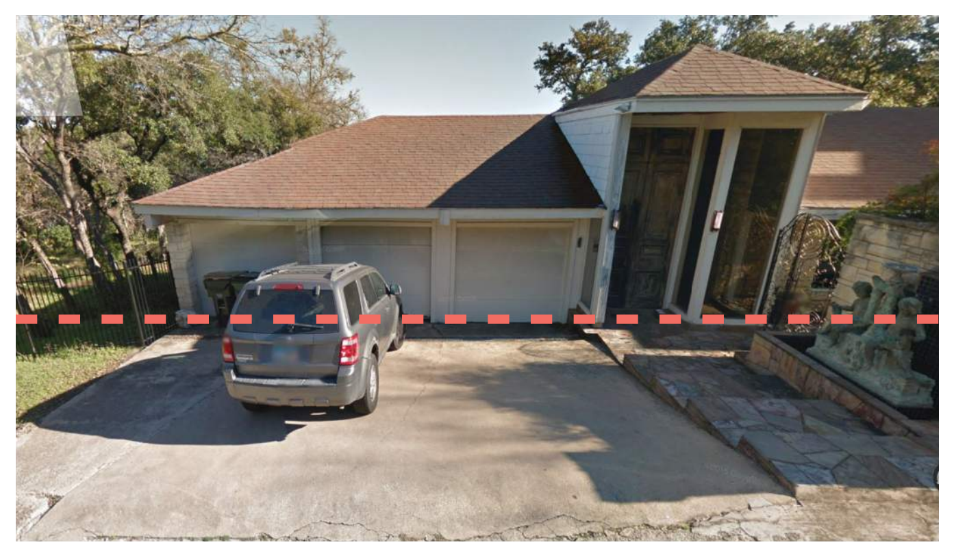
Proposed 5' Setback shown as red dashed line