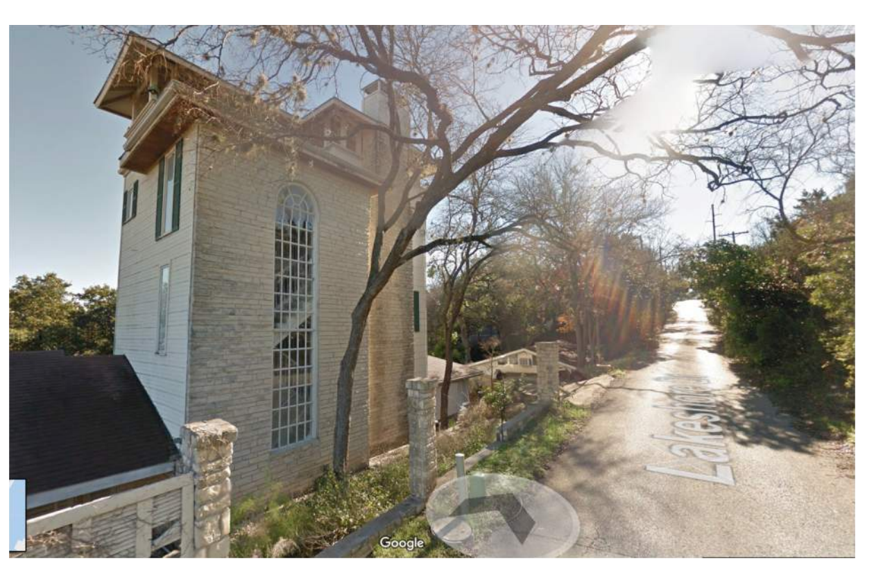
4 Story 45' Tower to be Removed