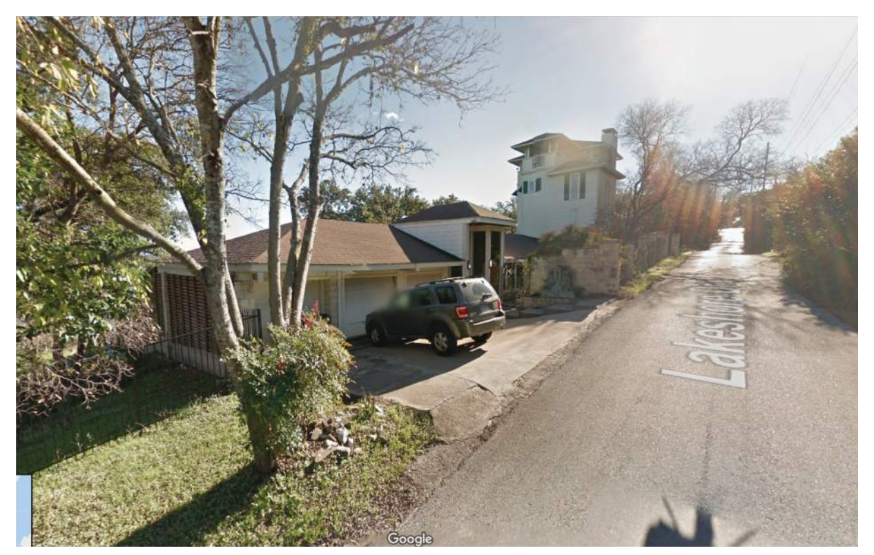
4 Story 45' Tower to be Removed