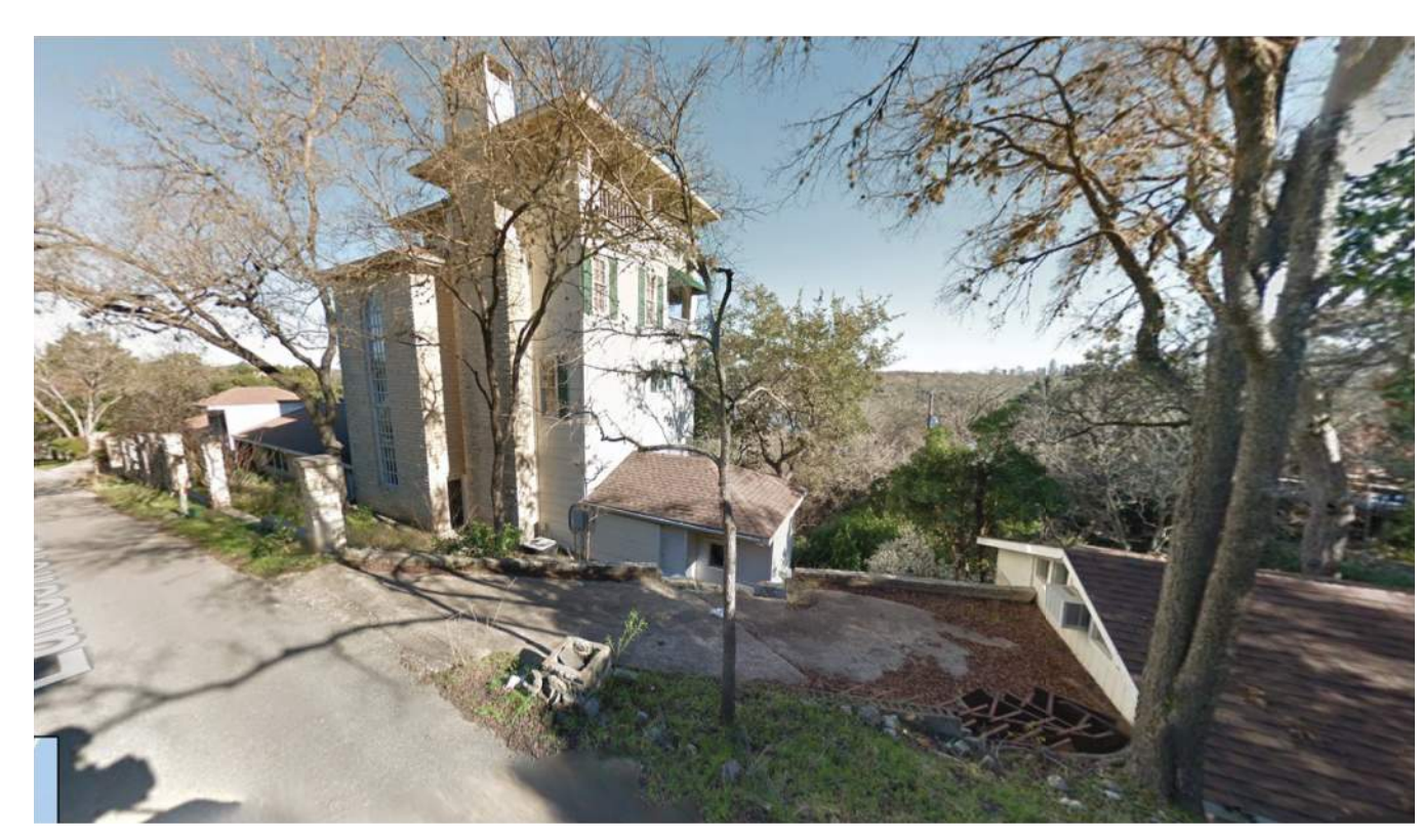
4 Story 45' Tower to be Removed (Guest House at bottom right)