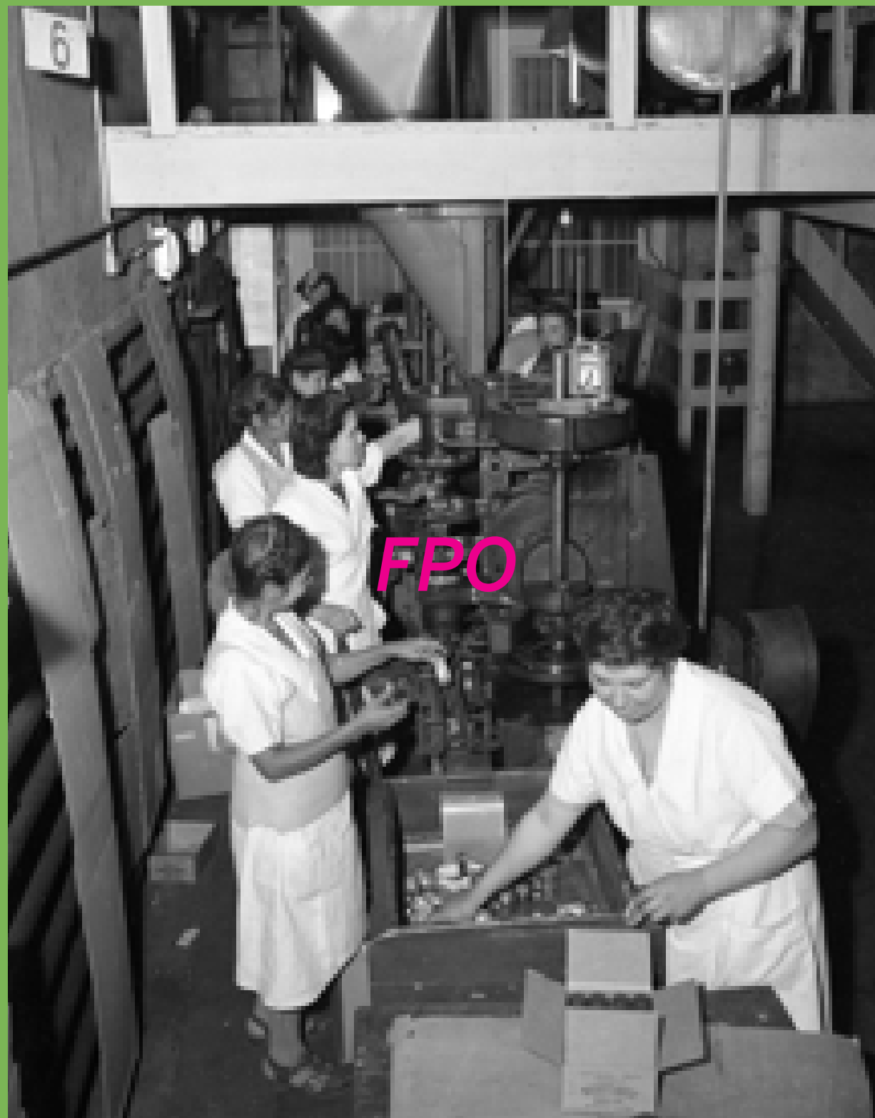
Walker's Austex Chile Factory assembly line. Walker's factories were located immediately south of Republic Square. Citation TBD

The food tradition continues today with the Sustainable Food Center's farmers' market that is held each Saturday morning at Republic Square.