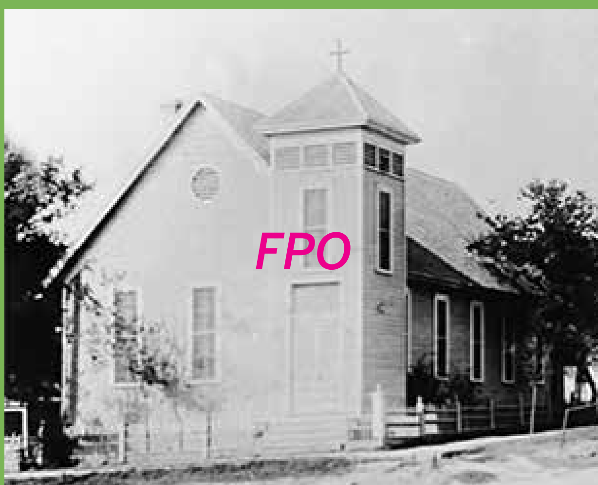
The original Our Lady of Guadalupe Church was located immediately north of Republic Square. Citation TBA

By the Great Depression, the residents of "Mexico" had moved east, along with their stores, churches, foods, and fiestas. Many from Austin's current Latino population, now residing east of I-35, can trace their lineage to Guadalupe Park and the "Mexico" neighborhood.