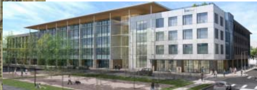
Texas Mutual Insurance