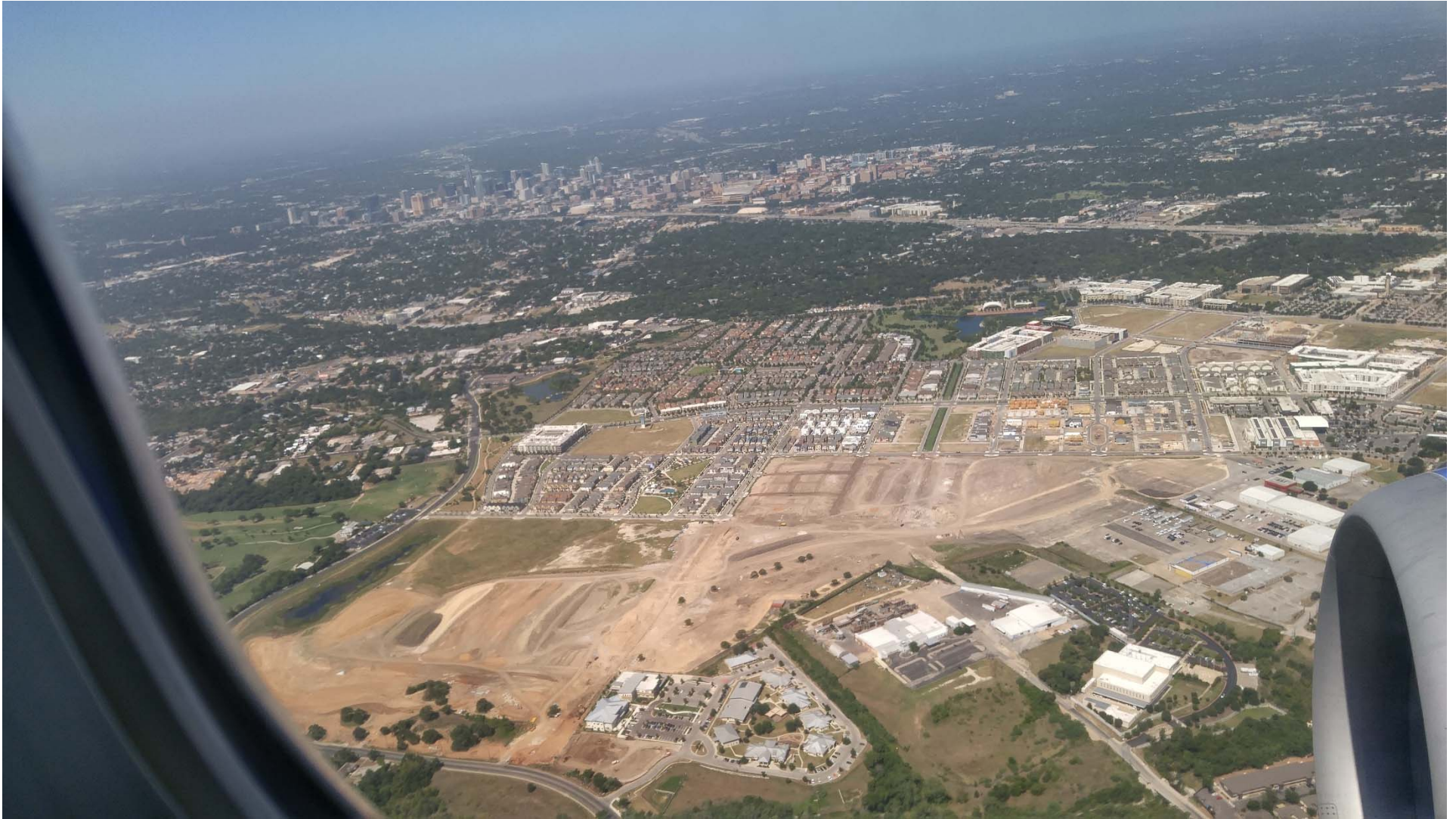
In-Flight View – July 2017