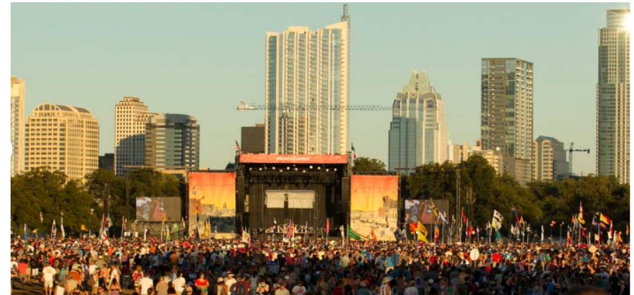
View from ACL Fest: left, October 2004. Right, October 2012