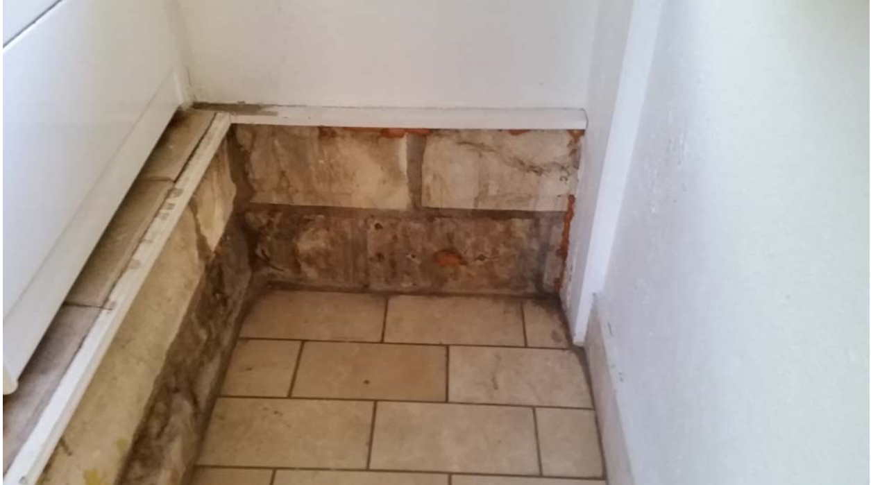
Fig. 3. Below grade masonry at utility room.