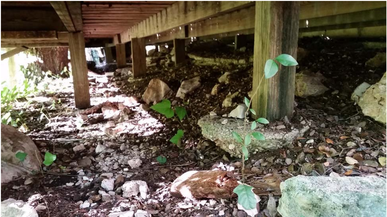
Fig. 7. Shallow, undermined footings at guest house deck.