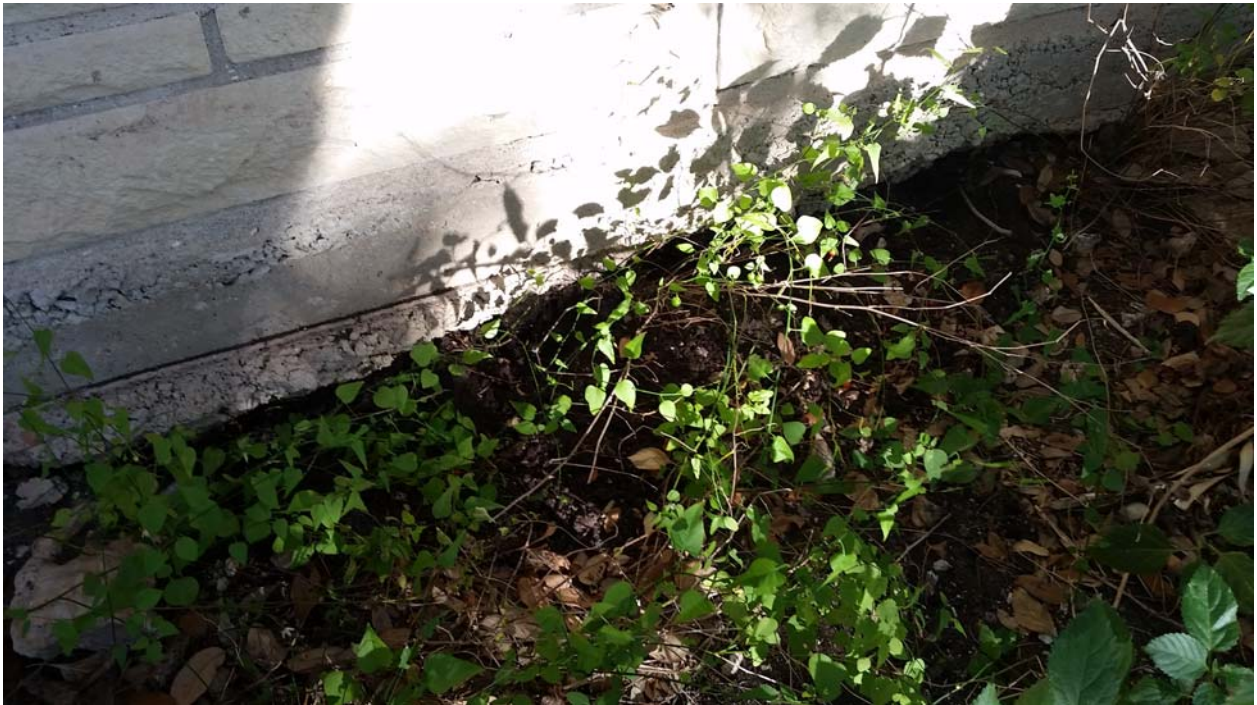
Fig. 4. Undermining of foundation at masonry skirt.