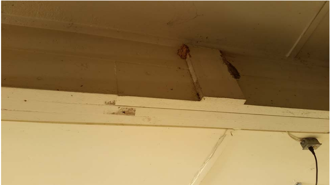
Fig. 2. Spliced, stacked beam at carport.