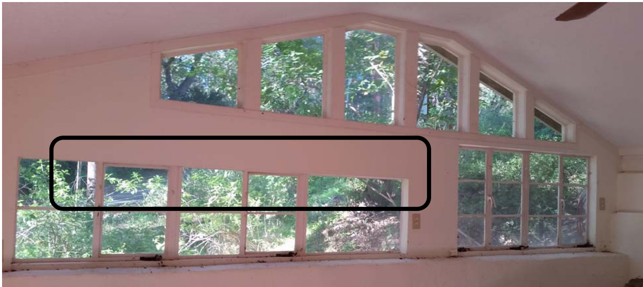
Fig. 6. South gable wall of guest house.

Severe cracking is present in the exterior masonry retaining wall at the north side of the guest house and it is rotating out-of-plane away from the retained earth. It appears the wall has been previously repaired but cracks have reappeared.