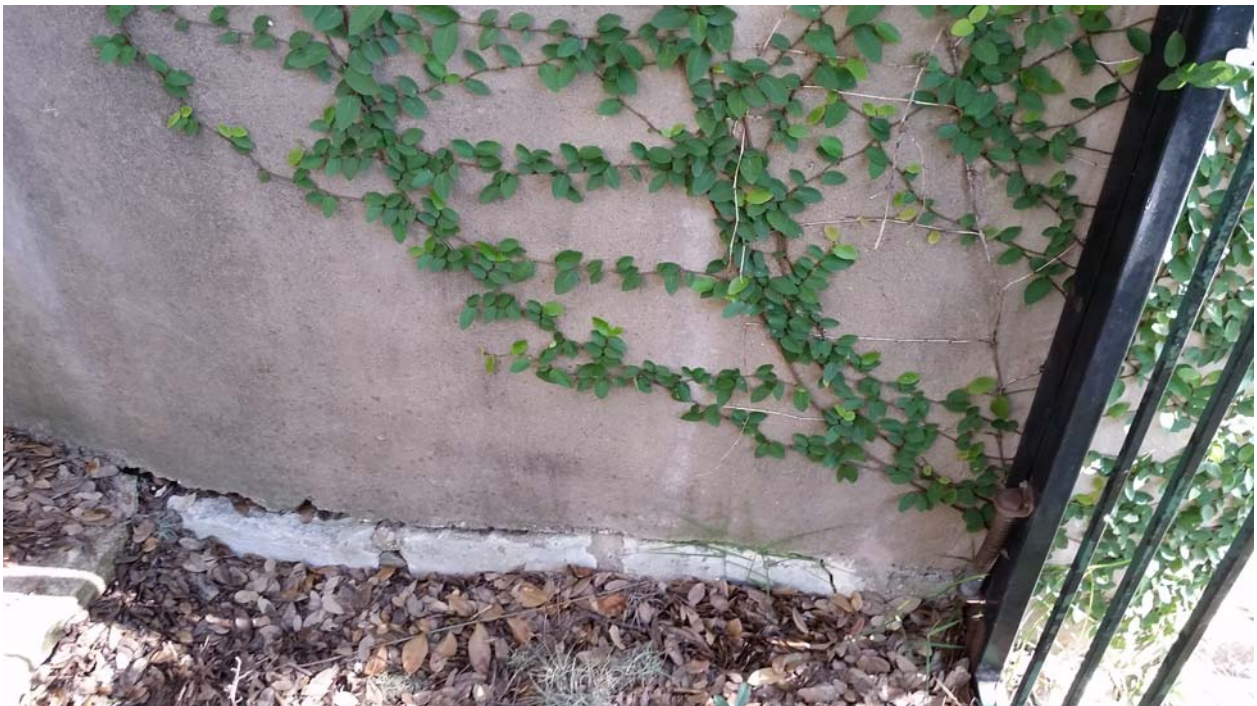
Fig. 5. Pool deck wall bearing on masonry.