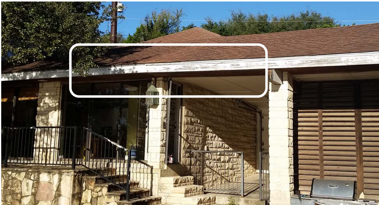
Fig. 1. Bowing of roofline at rear of house.

The south pool deck wall appears to be concrete. The wall bears on masonry at one location and is undermined at another (Fig. 5). The steel posts at the pool rail are severely rusted at the base.