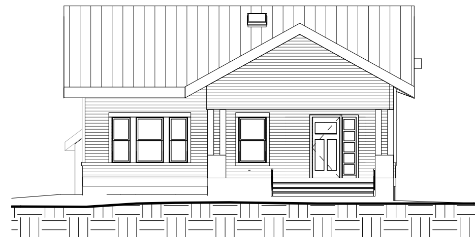
② HLC - BUILDING - W 3/32" = 1'-0"