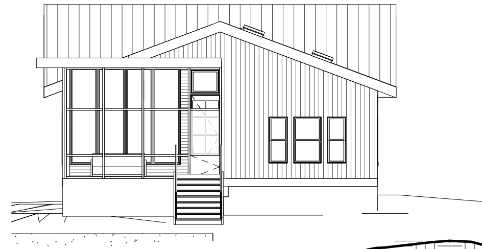
① HLC - BUILDING - E 3/32" = 1'-0"