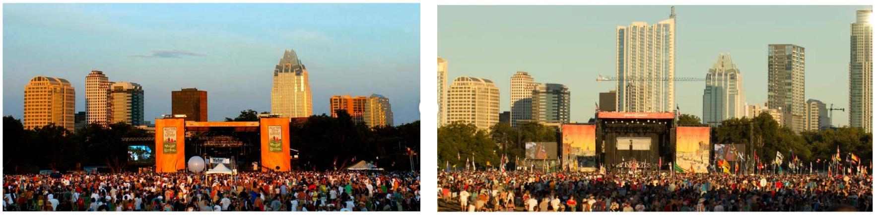
View from ACL Fest: left, October 2004. Right, October 2012