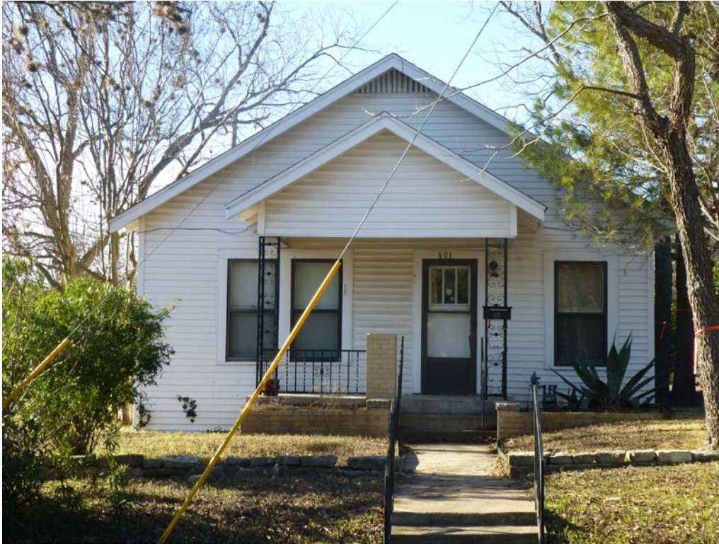
Primary (north) façade of 801 W. Live Oak Street.