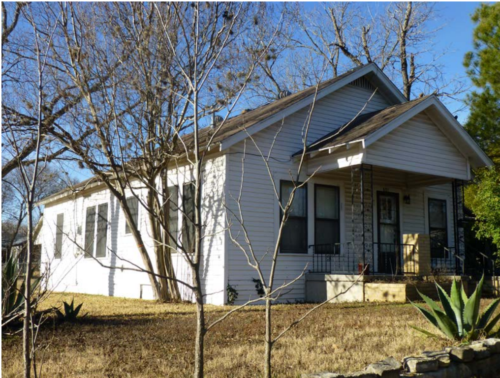
West elevation and primary façade.