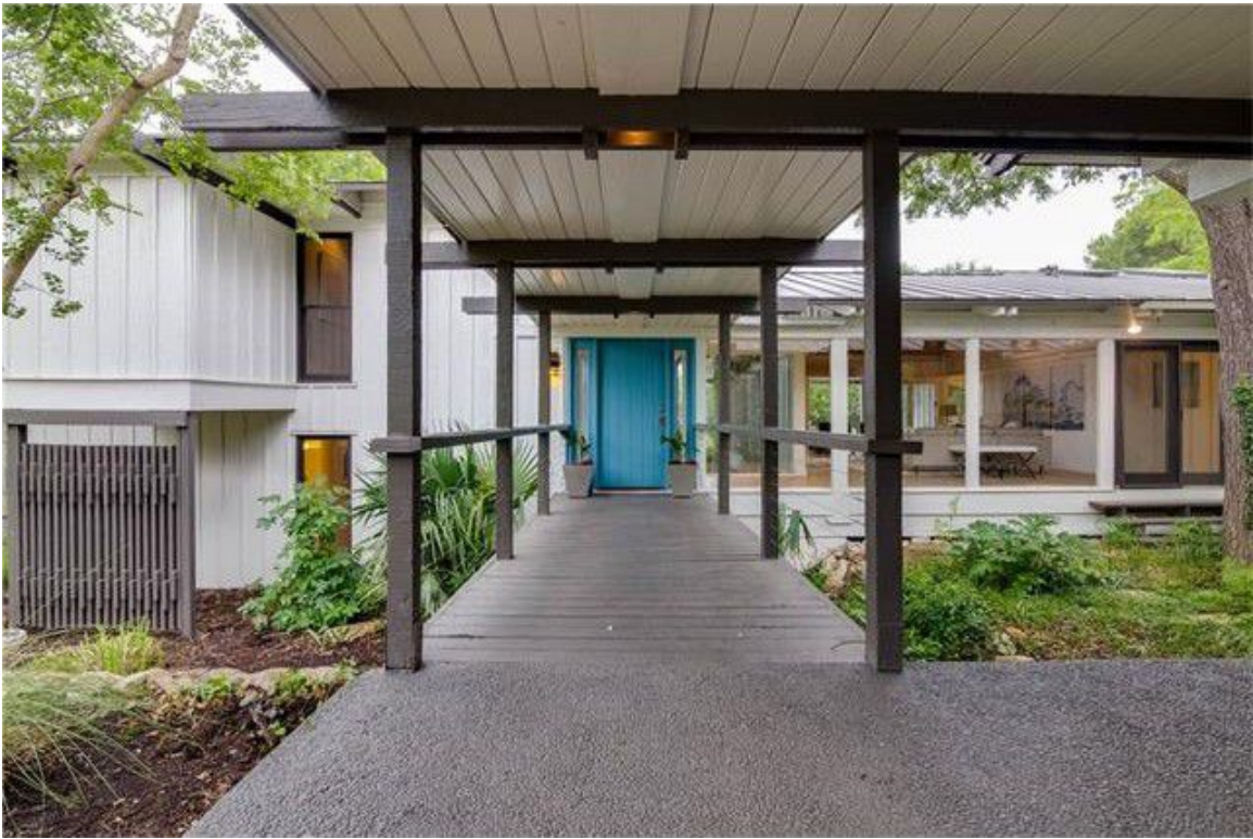
Realtor's photo of the entry to the house