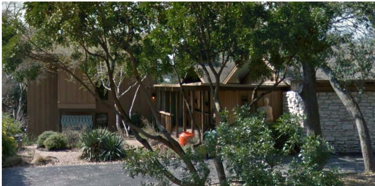
Google StreetView photograph from February, 2015 shows the house before the woodwork was painted white.

City Directory Research, Austin History Center By City Historic Preservation Office December, 2017