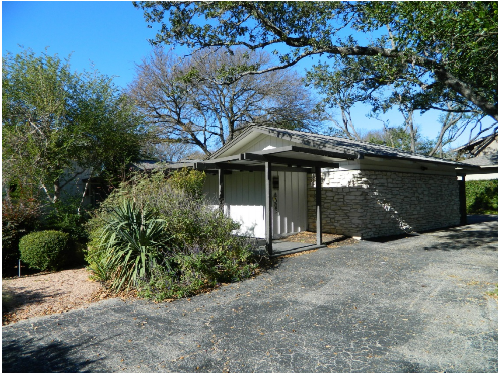
4605 Farhills Drive ca. 1966