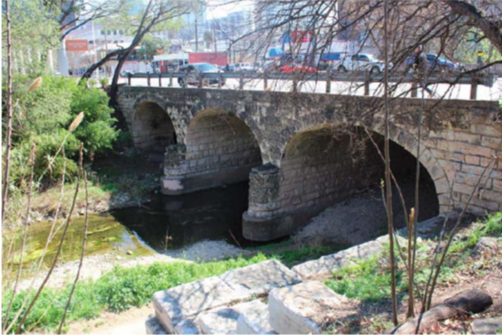
West 6th Street Bridge, Shoal Creek, Austin, Texas

Thank you to the Texas Historical Commission as well as the Conservancy's Historic Bridge Committee for your support of this project.