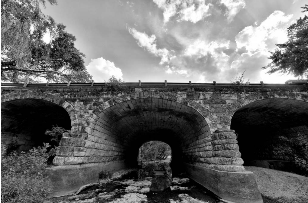
West 6th Street Bridge, Shoal Creek, Austin, Texas

Did you know that the West 6 th Street Bridge over Shoal Creek is older than the Texas State Capitol Building?