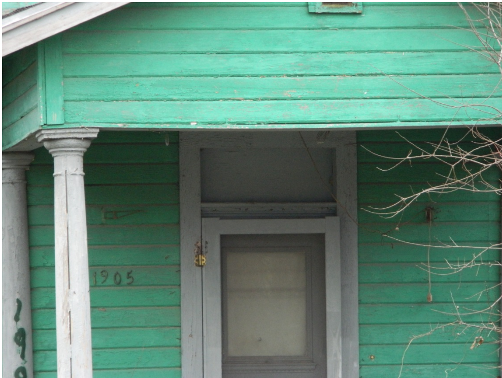
Close up photo of the front door showing the transom.