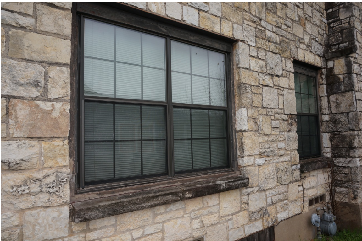
The original wood windows have been replaced with aluminum windows.

Additional photographs furnished by the applicant: