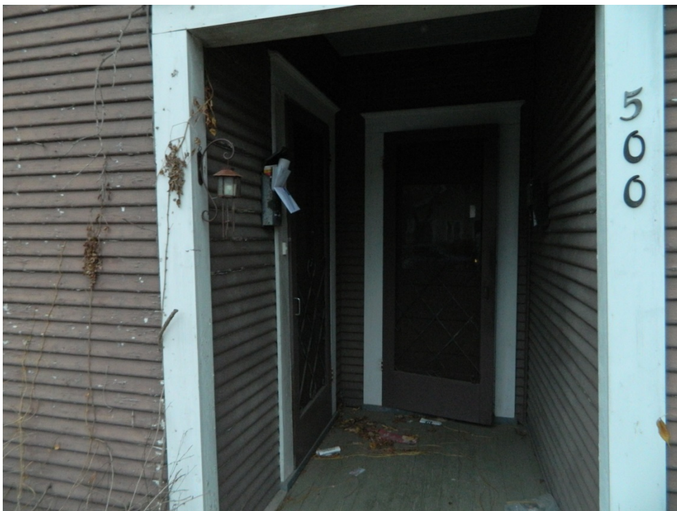
Doorway showing probable enclosure of porch to right of the front door.