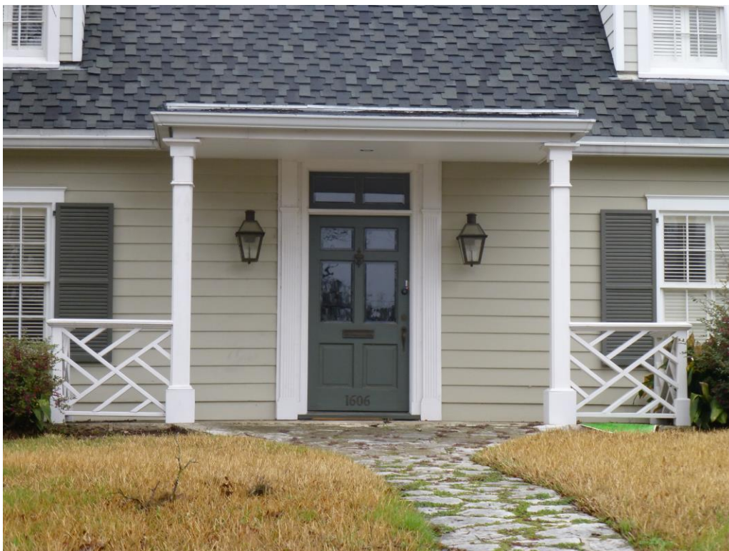
Detail of entry porch.