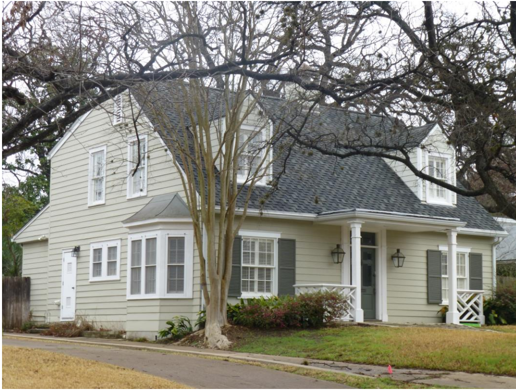
1606 Westover Road.