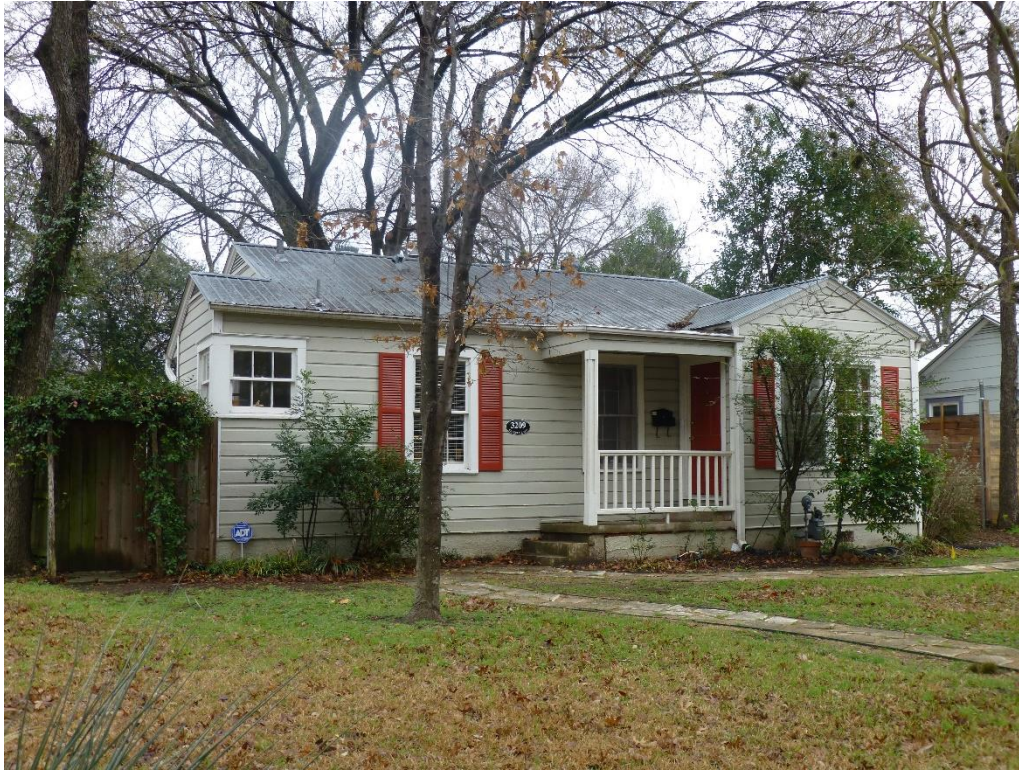
Primary house at 3209 Beverly Road.