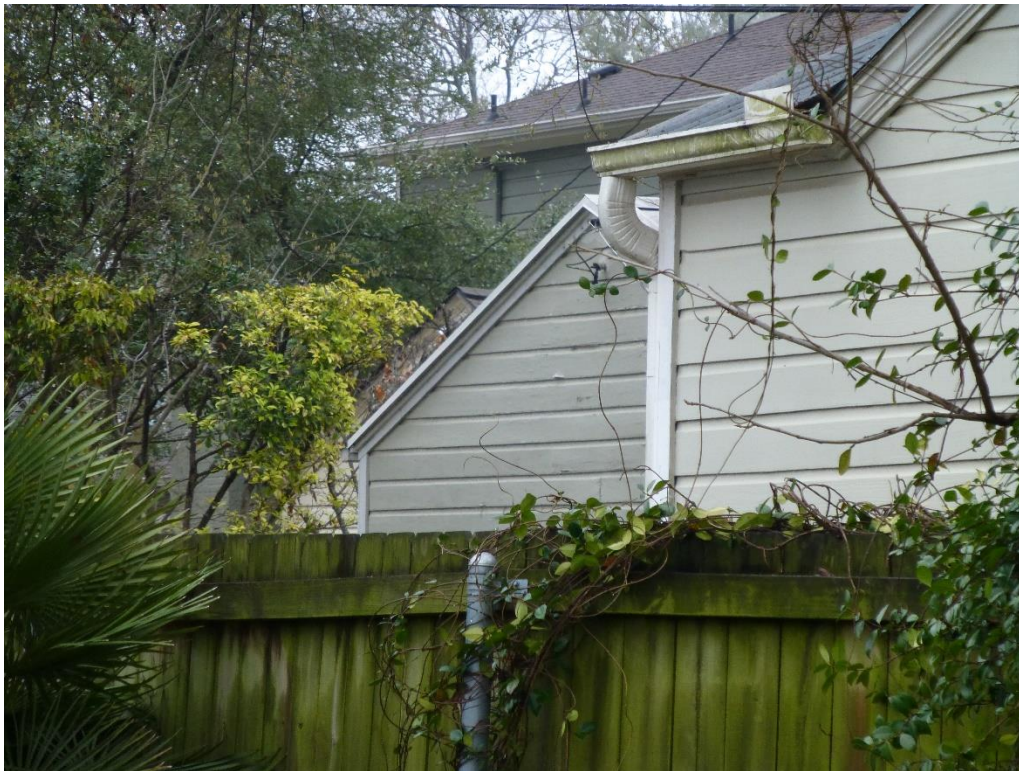
Partial view of rear garage.