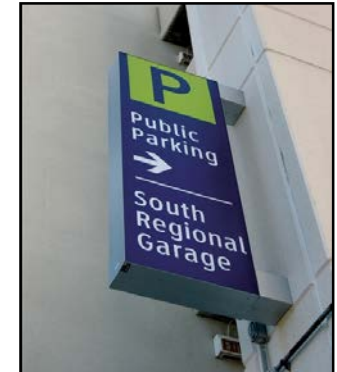
Tampa's Parking Dept.