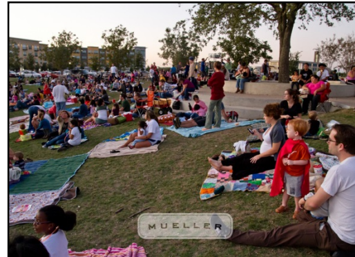
Mueller Lake Park