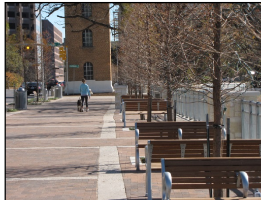
COA Great Streets