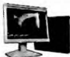
IDEXX DR ® 1417 Digital Imaging System