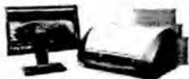
IDEXX I-Vision CR ® Digital Imaging System

One extended maintenance agreement, three systems: