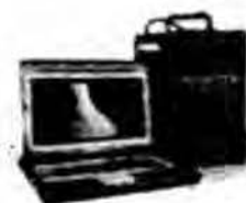
IDEXX EquiView ™ Digital Imaging System

CR scanner Capture station (computer) ‡ Color monitor ‡ External hard drive ‡ IDEXX-PACS Imaging Software reference guides and tutorials IDEXX-PACS Imaging Software upgrades