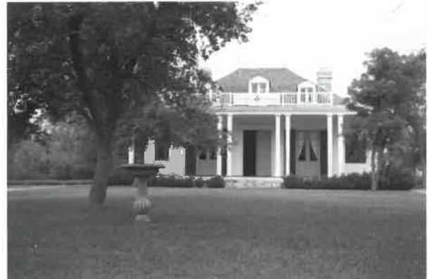
front entrance of house, date October 26, 1958