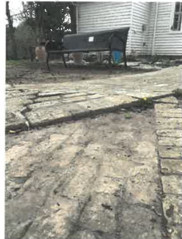
Pathway between Carriage House and French Legation House, March 9, 2018