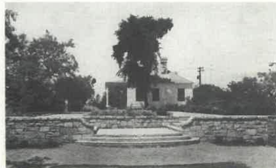
Eleanor Thomson Hutchinson Memorial Steps, Old French Legation, Austin, Texas