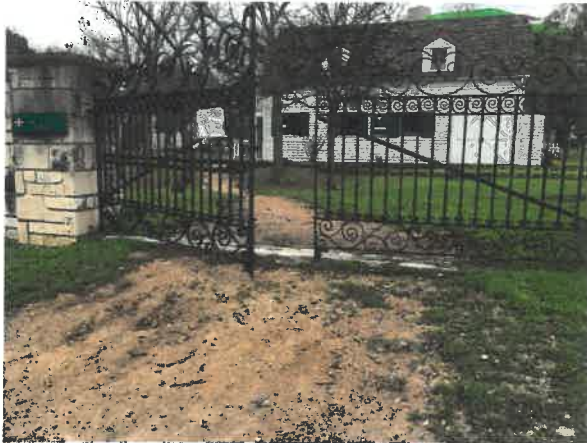
Entrance Gate to French Legation Property, March 9 th , 2018