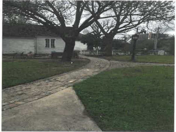
Pathway to Carriage House, date March 9, 2018