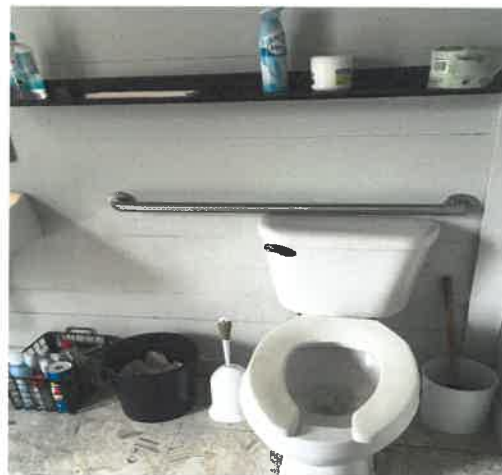
View of bathroom at the Carriage House, date March 9, 2018