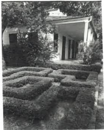
eastern side of house, porch, and sculpted gardens, date 1970- 1980