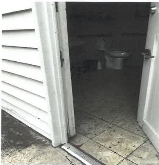
Carriage House Bathroom, March 9, 2018