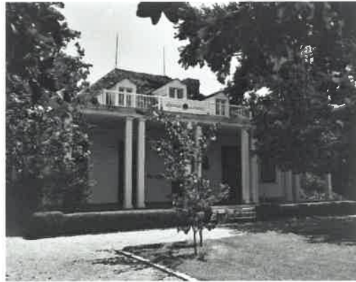
date unknown