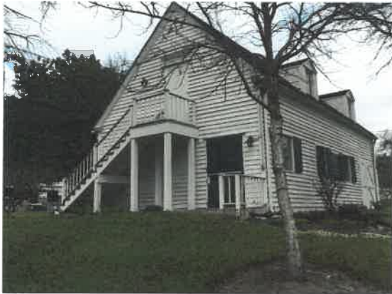
Side View of Carriage House, March 9, 2018