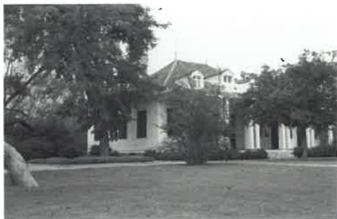
French Legation lawn, date October 26, 1958