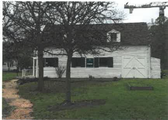
View of east wall of Carriage House, March 9, 2018