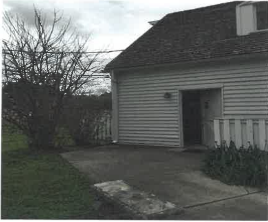
Carriage House, date March 9, 2018