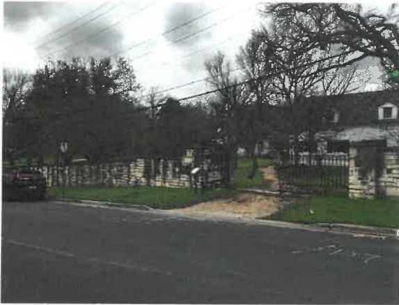
Entrance to French Legation Property, March 9, 2018