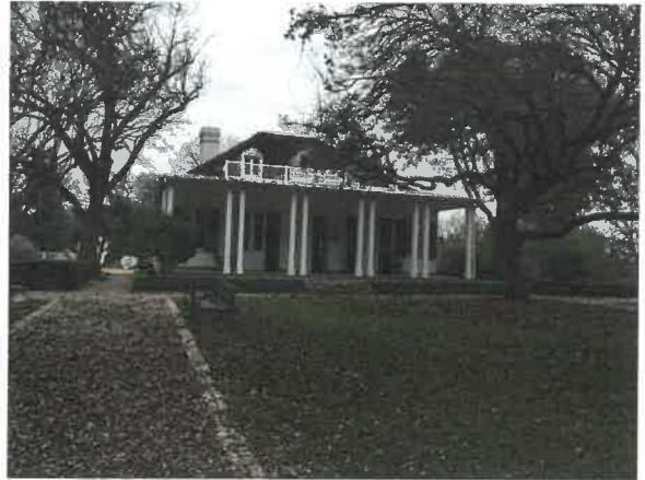
Front of French Legation House, March 9, 2018