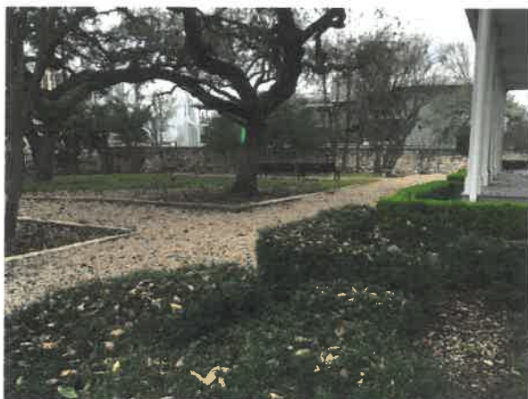
Pathways to front of French Legation House, March 9, 2018