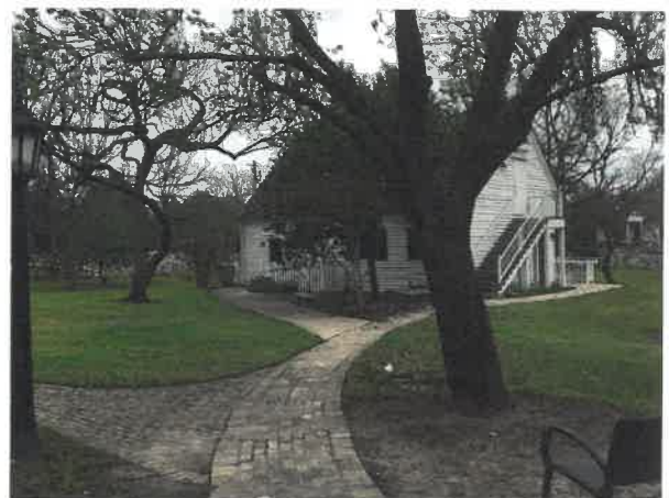
Pathway between French Legation House and Carriage House, March 9, 2018