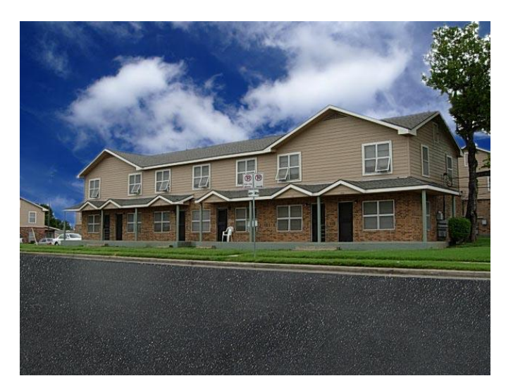
Housing Authority of the City of Austin - Booker T. Washington housing property (recipient of connection)

Free Connection is available for 10 years from the start of the Network Services Agreement (start date: 2013)