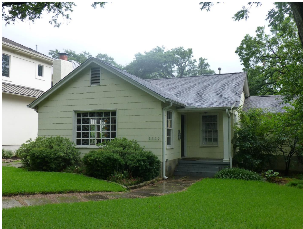
South (primary) façade and east elevation of 1402 Mohle Drive.