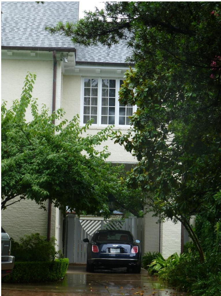
Detail of porte-cochere.