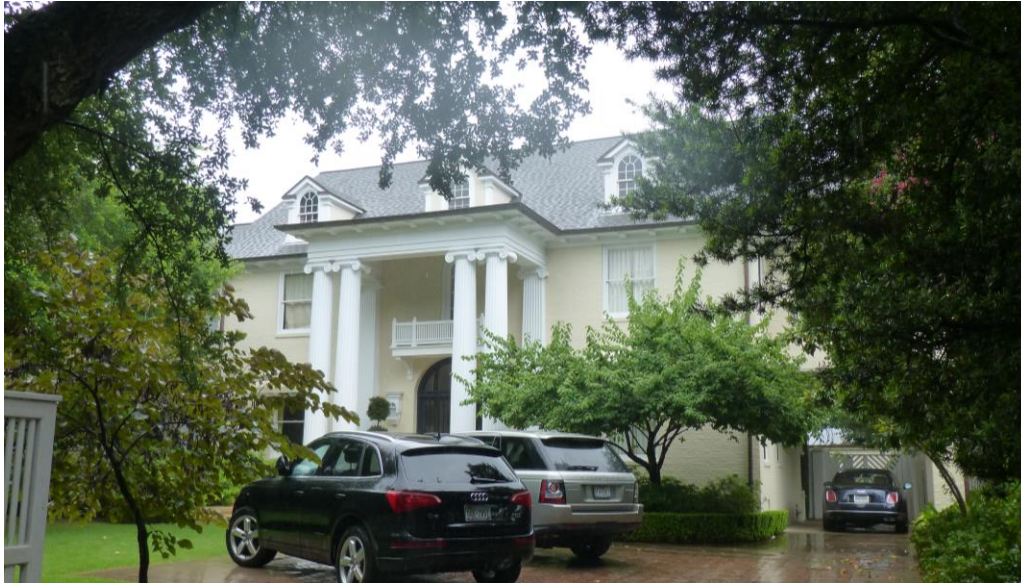
East (primary) façade of 1708 Windsor Road.