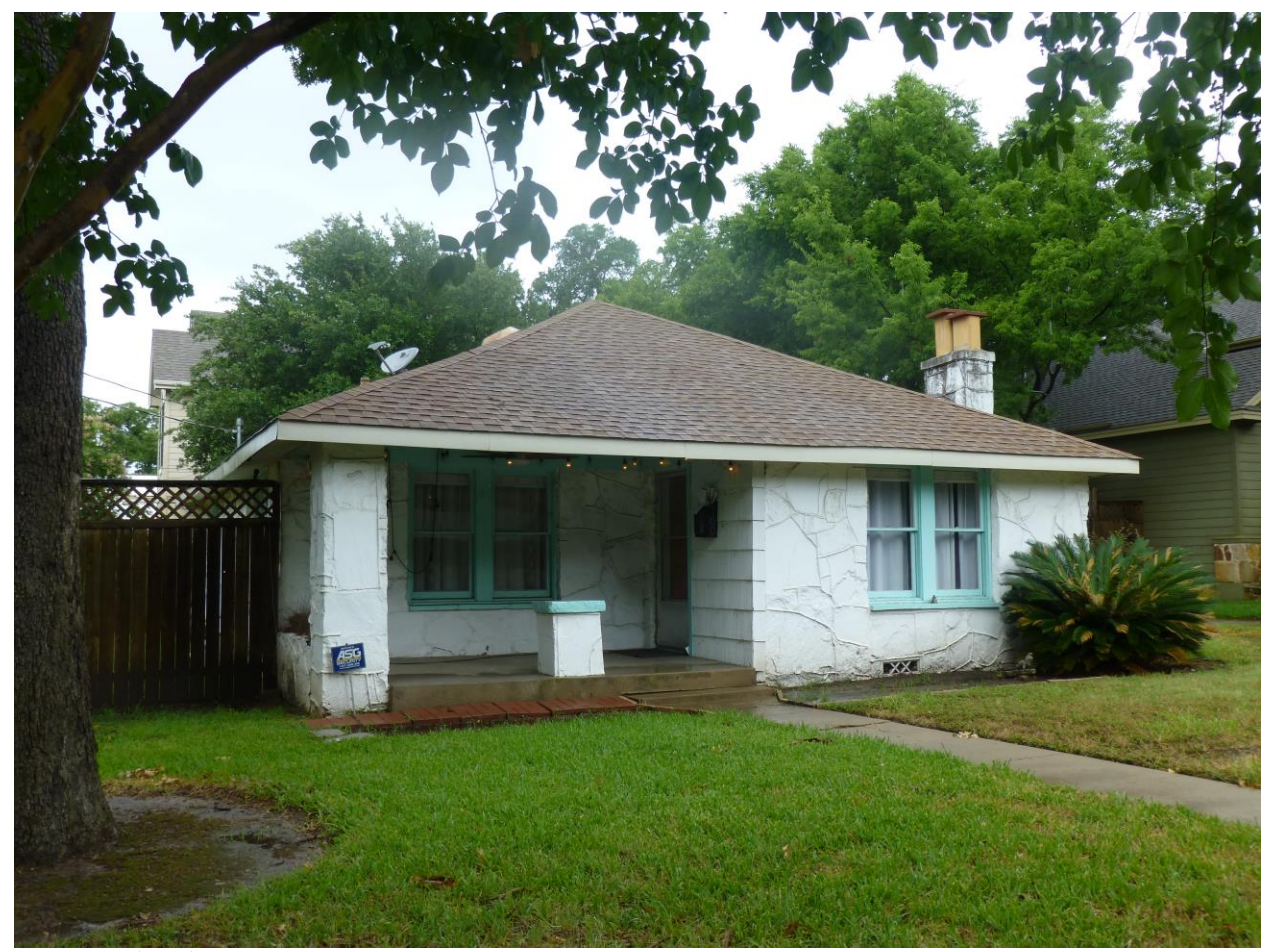
Primary (east) façade and south elevation of 700 Wayside Drive.