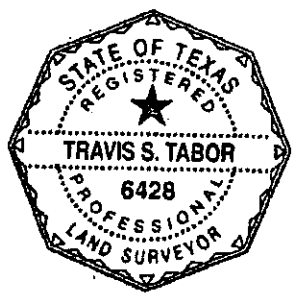
Registered Professional Land Surveyor State of Texas No. 6428

Job Number: 17-058 Attachments: CAD Drawing: L:\Surveying and Mapping\17058 - 500 MONTOPOLIS\CAD\DWG's\500 MONTOPOLIS