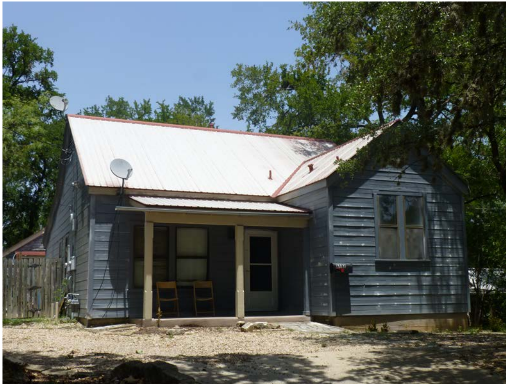
West elevation and south (primary) façade of 1712 W. 11 th Street.